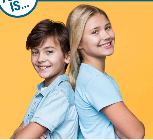
The bond between siblings is extra-special, even more so if one of them has a life-long illness or a disability. Sibling Day is a way of honouring that special bond.