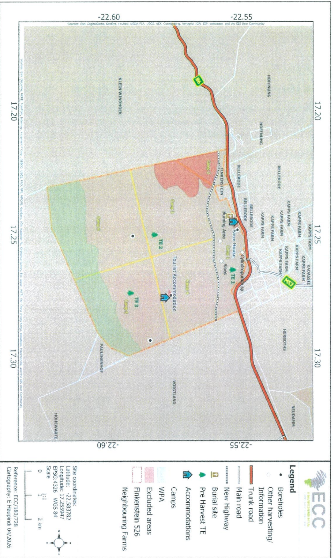
Figure 1 – Locality map of the Farm Management Unit (FMU) identified as Finkenstein no. 526, located in the Khomas Region of Namibia.