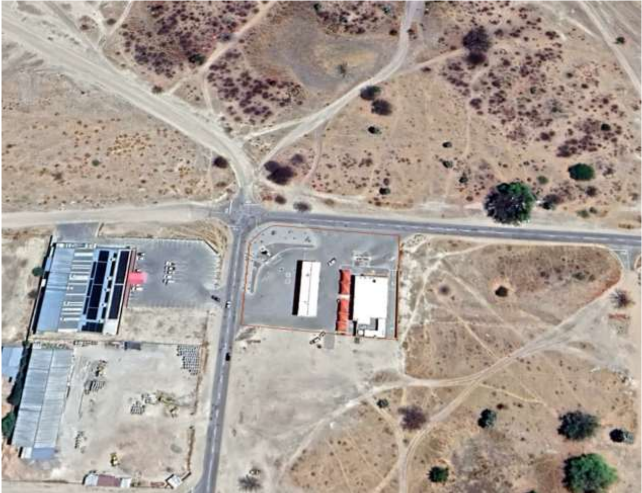
Figure 2. Layout of the site