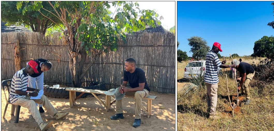
Figure 3: The one-on-one EIA engagement with the neighbouring homestead/mahangu field owner to the site on the 29th of April 2026

The EIA one-on-one engagements had an attendance of twenty-one (21) people (four representatives from the Town Council, sixteen from the Kulisuka Primary School, and one homestead owner neighbouring the site). The combined signed attendance register is attached hereto. The engagements were facilitated by an Environmental Assessment Practitioner from Serja Consultants.