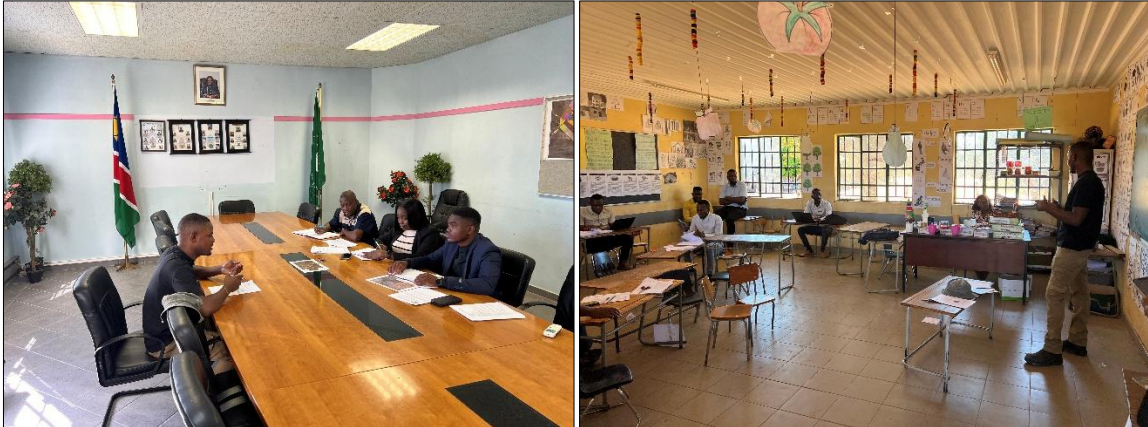
Figure 2: The one-on-one EIA engagements with the representatives from the Nkurenkuru Town Council and Kulisuka Primary School on the 29th of April 2026