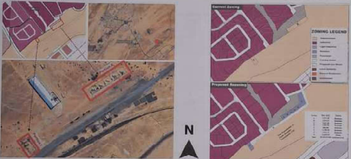
Aerial Locality Image and Current and Proposed Plans of the subject portions as the remaining extent of the Farm Arandis Townlands No. 170

The Arandis Town Council intends to align the current land uses of Portions A to G with the Arandis Zoning Scheme. Therefore, a subdivision and subsequent rezoning is required in order to legally subdivide the residential units from Farm Arandis Townlands No. 170 and register them as individual stand-alone erven.