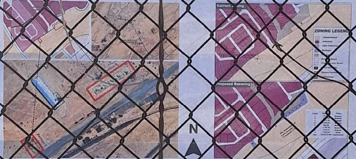
Aerial Local Image and Current and Proposed Plans of the subject portions on the remaining extent of the Farm Arandis Townlands No.170

The Arandis Town Council intends to align the current land use of Portions A to G with the Arandis Zoning Scheme. Therefore, a subdivision and subsequent rezoning is required in order to legally subdivide the residential units from Farm Arandis Townlands No. 170 and register them as individual stand-alone units.