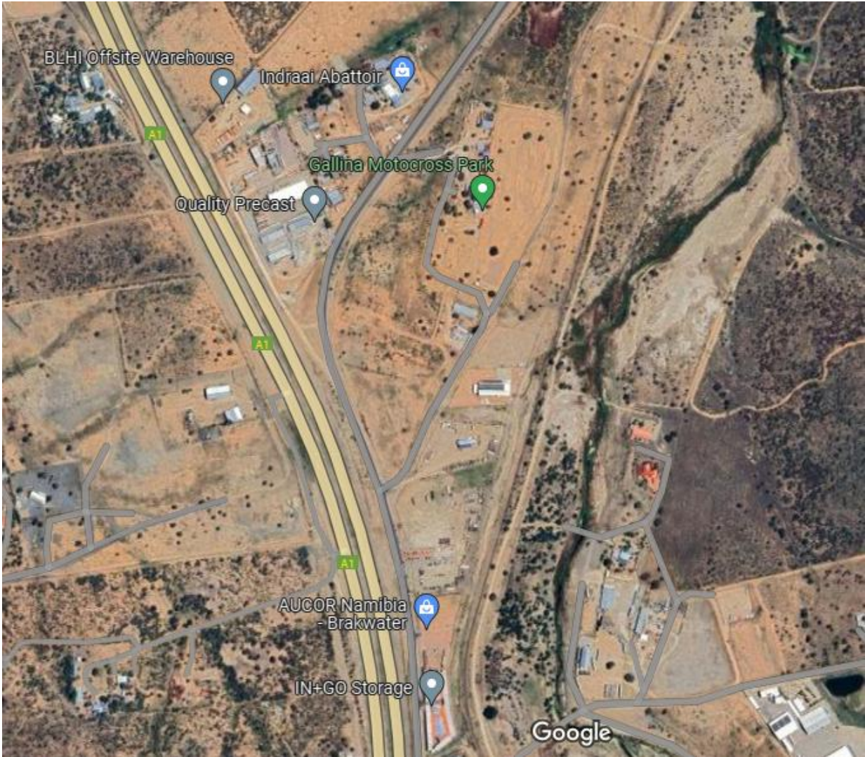
Figure 1: Google map image of activities on Re/H/48 and surrounding portions

The Remainder of Portion H of the Farm Brakwater No. 48 is located east of the A1 National road between Windhoek and Okahandja and wedged between the railway and the national road. The well-known Gallina Motocross track and Waldschmidt Eggs are located on the Remainder of Portion H of the Farm Brakwater No. 48. Other storage and logistics facilities are also located on the southern part of the Remainder of Portion H.