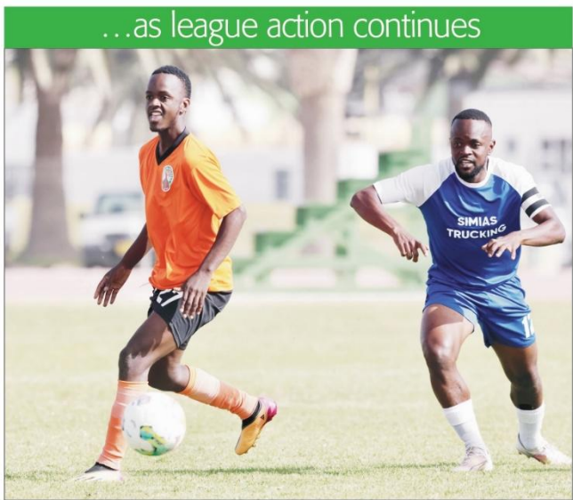
Intensifying... The Debmarine premier league will continue this weekend with a number of exciting games.