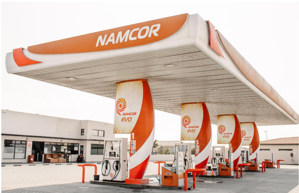
Photo 1. The existing Pitstop Fuel Centre .

Conveniently located on the outskirts of Swakopmund ,and along the Henties Bay Road, the Service Station offers a convenience store, tyre shop, butchery and a car wash. See the photo below for the site layout.