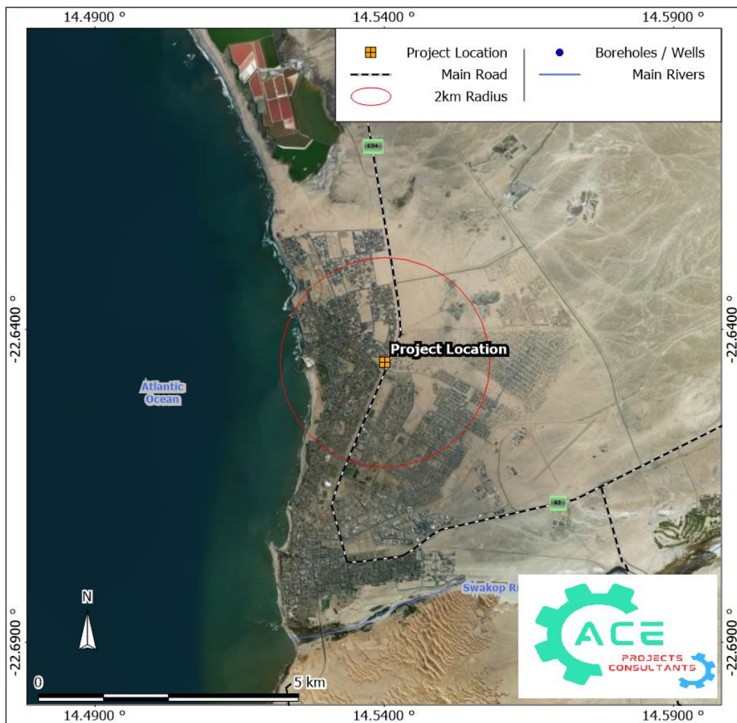
Figure 2. Hydrogeological Map

The shallow groundwater levels in the area would increase the risk of groundwater pollution. This might become a pathway if interaction between contaminated groundwater and surface water takes place. This is however not expected to take place due to the large distances between the site and the Atlantic Ocean. The developer is advised to install precautionary groundwater monitoring boreholes to ensure early leaks detection. This area does not fall within a Water Control Area; however groundwater remains the property of the Government of Namibia.