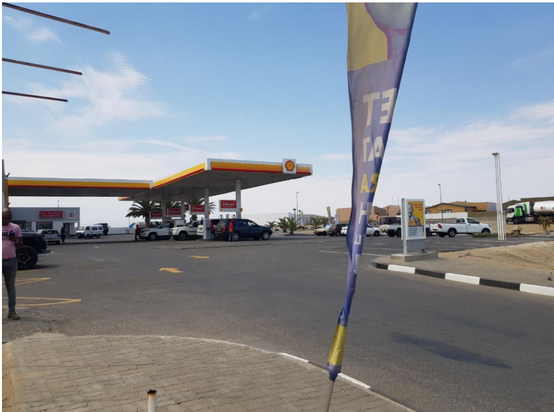
Photo 1. The existing Ocean View Shell .

Conveniently located on the outskirts of Swakopmund ,and along the Henties Bay Road, the Service Station offers a convenience store, tyre shop, butchery and a car wash. See the photo below for the site layout.