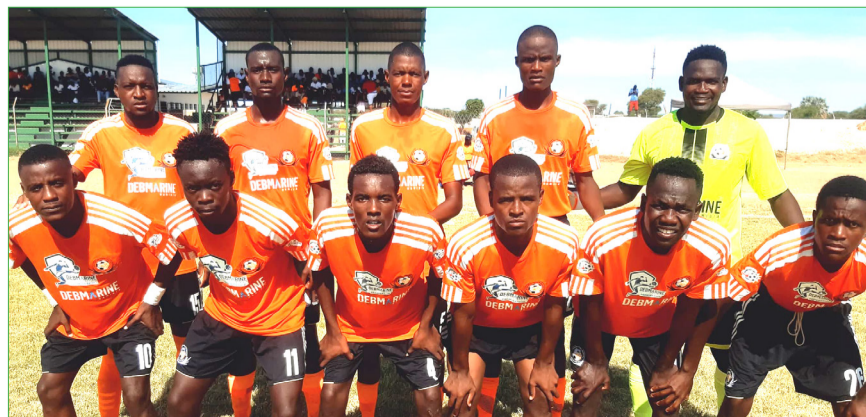
Content.. Okakarara Young Warriors is satisfied with pre-season friendlies.