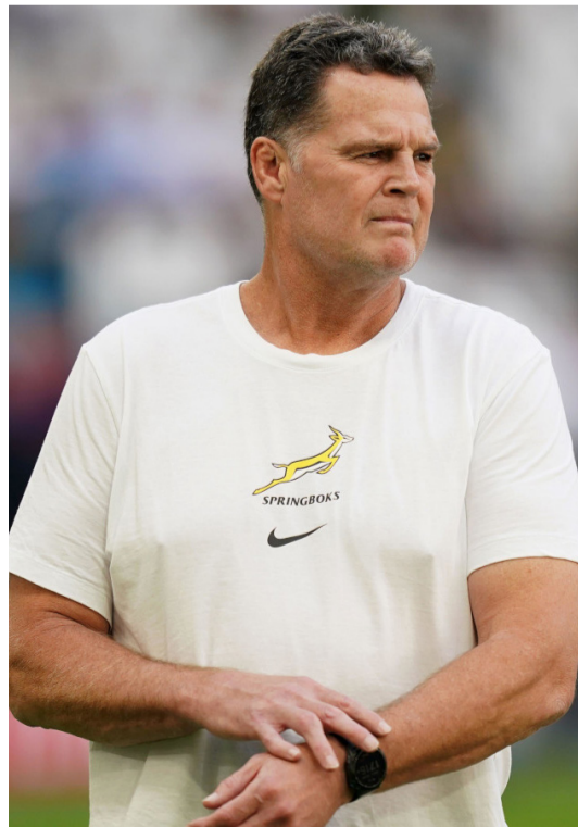
Genius... South Africa head coach Rassie Erasmus.

"They still have the same strengths, which they've developed even further; In those sectors, they performed better than us, once again. They're a great team," Galthie said. - SuperSport