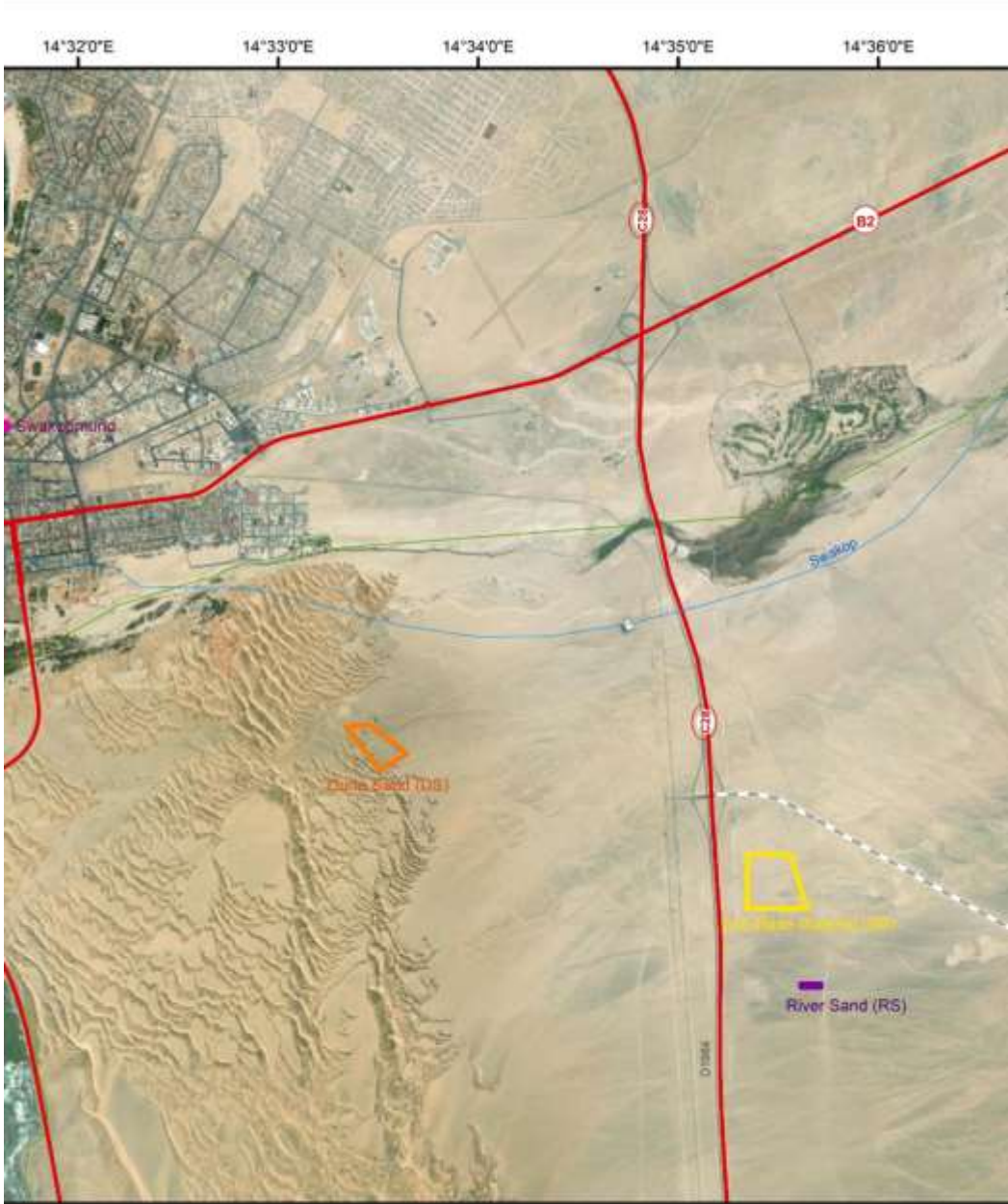
Figure 1: Map showing the location of the three proposed borrow pit sites selected by the proponent.

gentle slopes; and dune sand will be skimmed from interdune areas and gentle flanks without cutting into dune bodies. Progressive rehabilitation will follow immediately after extraction through re-levelling, slope softening, and natural wind-assisted recovery.