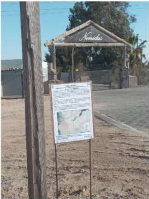
Notices at Nonidas