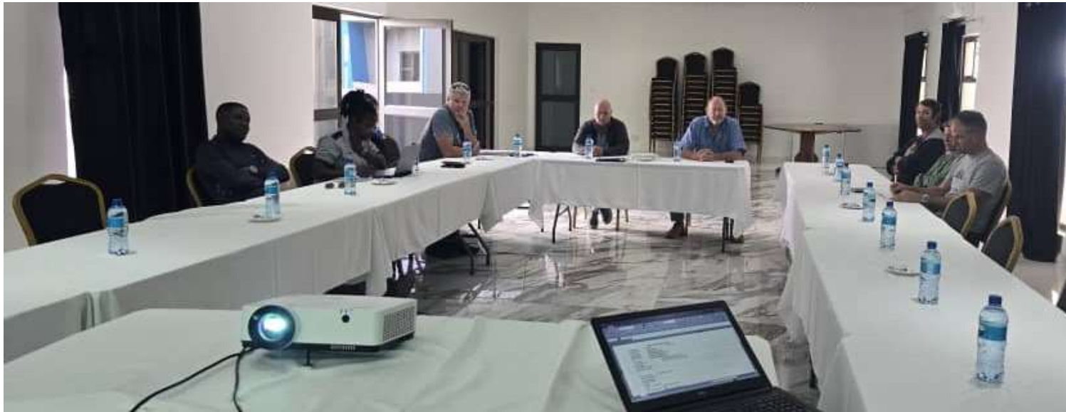
Figure 4: Meeting session (17 December 2025).