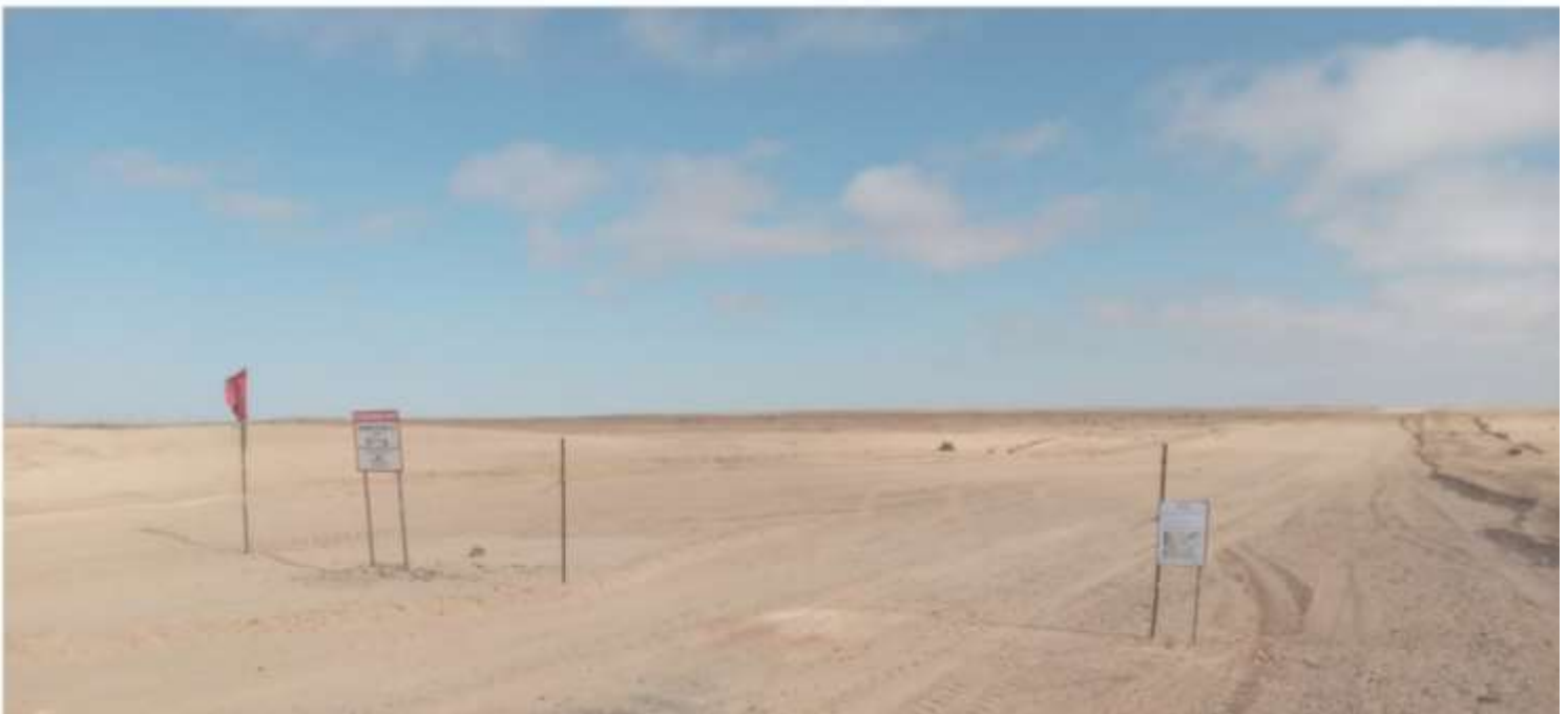
Notices at the site boundaries