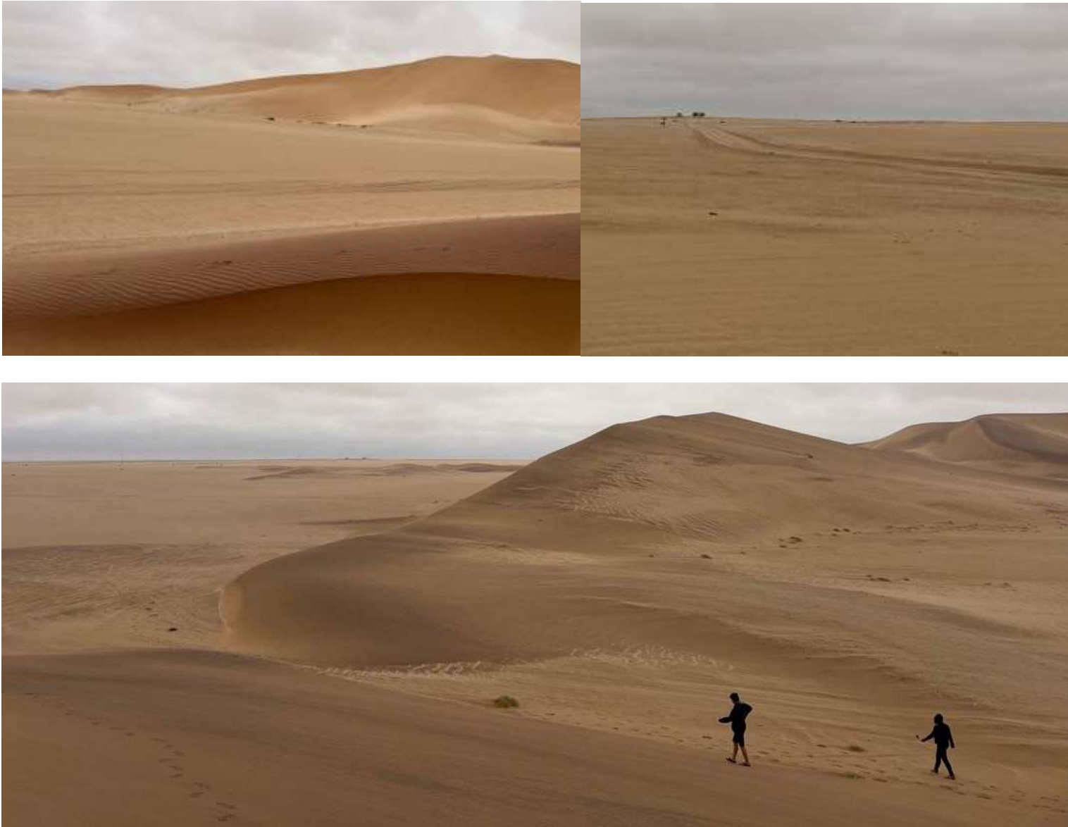
Figure 5: Siting for new location for sand dune extraction (17 December 2025)