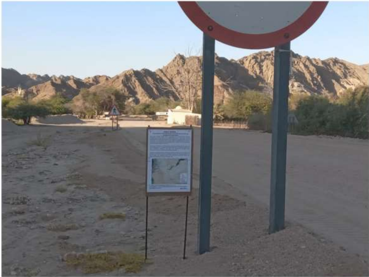
Notices at the Goanikontes