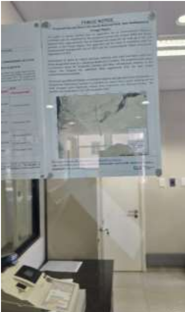
Notices at the Erongo Regional Council Notice board