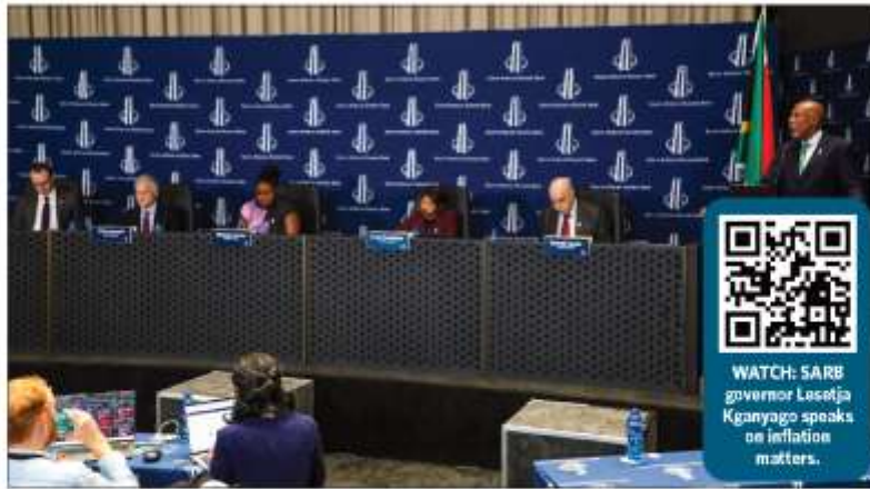
NEW NORM: South African Reserve Bank governor Lesetja Kganyago addresses the media while announcing a reduction in the repo rate by 25 basis points in that country this week, bringing it to 6.75%.

"To support communication and accountability, we therefore want it understood that inflation will not always be precisely 3%. When there are deviations, we will explain what has driven inflation away from target, and we will do what is required to get back to target," he said.