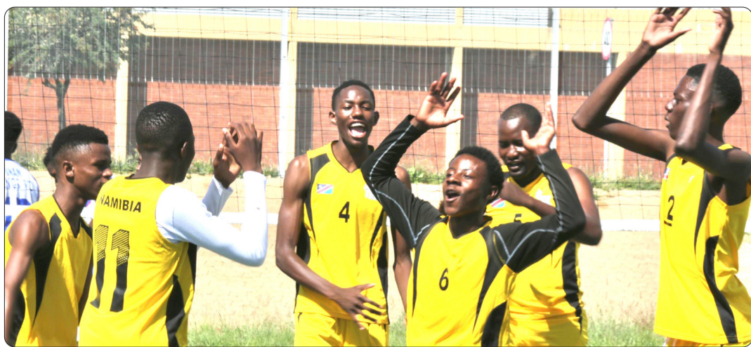
New season... Action from the Central Volleyball League at the UNAM main campus outdoor courts between Unam Kings D VC vs Afrocat E VC.