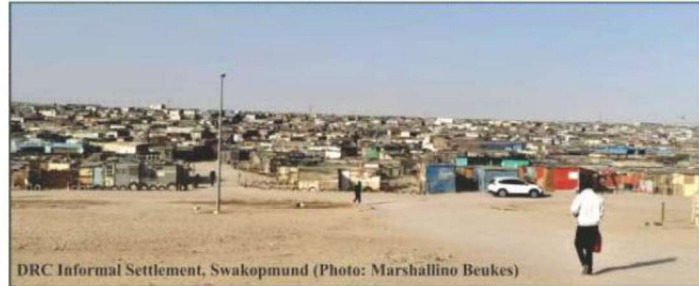
DRC Informal Settlement, Swakopmund