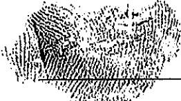
Headman: Utavi Tjihove