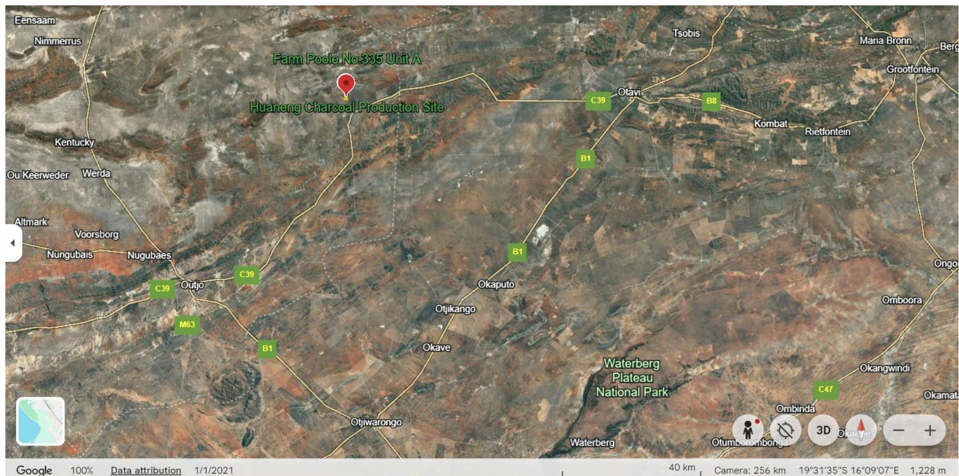
Figure 5: Google Map depicting the general location of Farm Poole No.335 Unit B on which Huaneng Charcoal Production Project site is located and in relation to the nearest formal towns (Outjo, Otjiwarongo and Otavi)