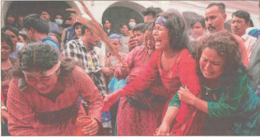
Mourning... So far, 73 protesters have died.