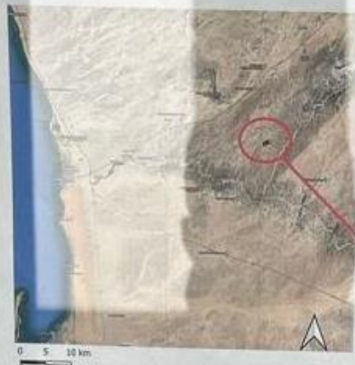
Claims Application Area

APPENDIX A: locality map for the proposed mining activities (mining claims: 75286, 75287, 75288 and 75251).