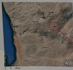
Claims Application Area

APPENDIX A: locality map for the proposed mining activities (mining claims: 75286, 75287, 75288 and 75251).