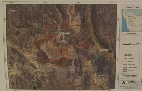
Locality map around EPL 9779