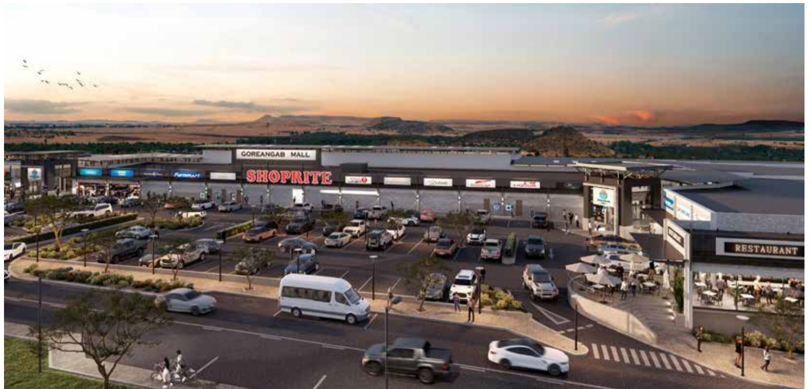
Oryx Properties is busy with the Goreangab Mall development, a first-of-its-kind project in the Katutura area scheduled for completion in May 2026.