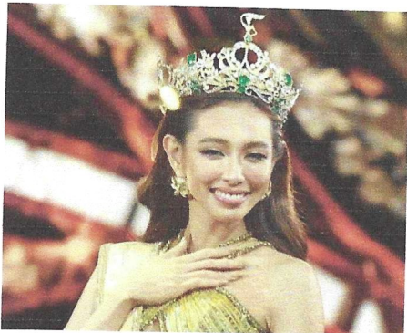
Jailed... Vietnamese beauty queen Nguyen Thuc Thuy Tien.

HANOI - A court in Vietnam sentenced a former beauty queen to two years in jail yesterday for falsely promoting gummies as rich in fibre on her social media channels, state media reported. The judges found Nguyen Thuc Thuy Tien guilty of deceiving customers, saying she was aware the fibre content of the candy was low at just 0.935%, VnExpress reported.