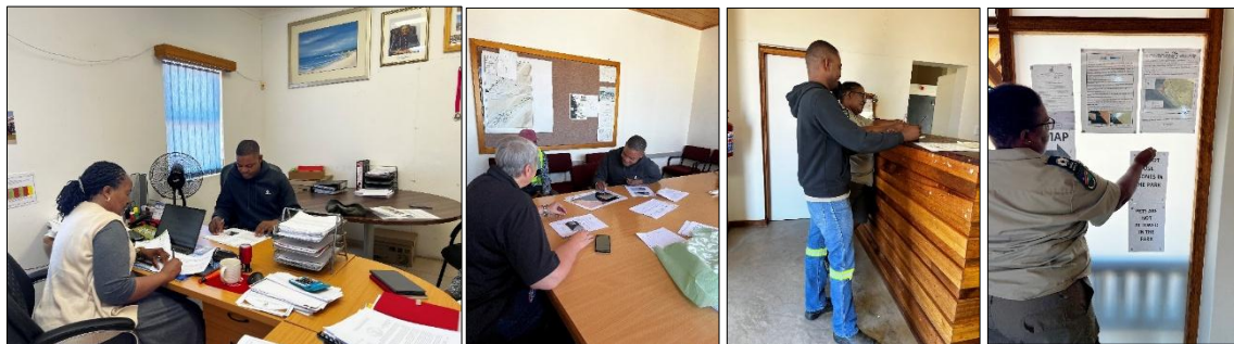
Figure 1: Some of proceedings of the EIA one-on-one engagements on the 08 th and 09 th of December 2025

The EIA one-on-one engagement and consultation sessions had an attendance of seven (7) people, including two Environmental Assessment practitioners (EAPs) from Serja Consultants, and one Archaeologist. The combined signed engagement register is attached hereto.