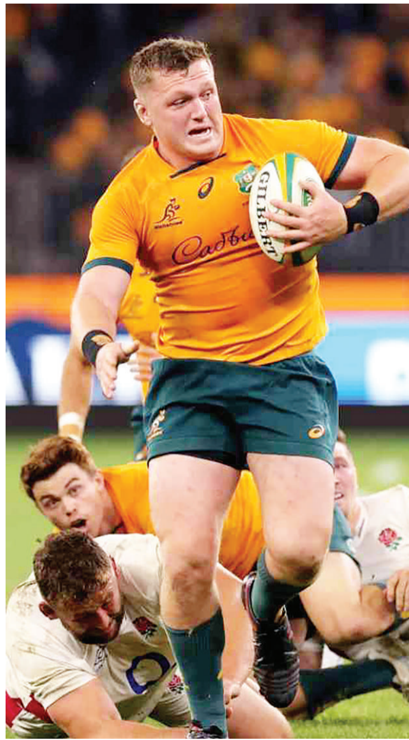
Energy... Australia prop forward Angus Bell.