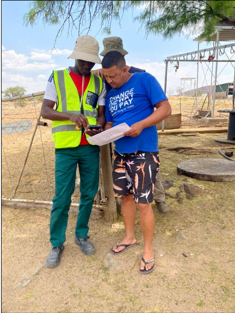
Figure 2: Farm to farm consultation, 17 October 2025, Hardap Region