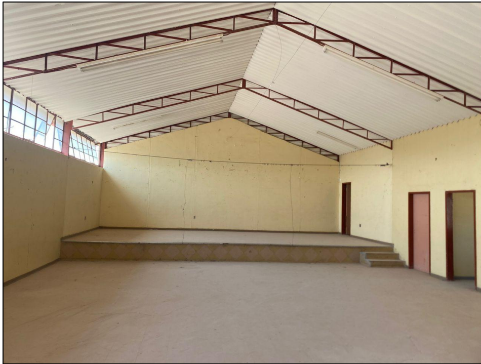
Figure 3: Public consultation meeting, no attendance, 18 October 2025, Hardap Region

Issues raised by I&APs have been recorded and incorporated in this environmental and social impact assessment report and the EMP. The summarised matters raised during the public meeting are presented in Table 6 below.