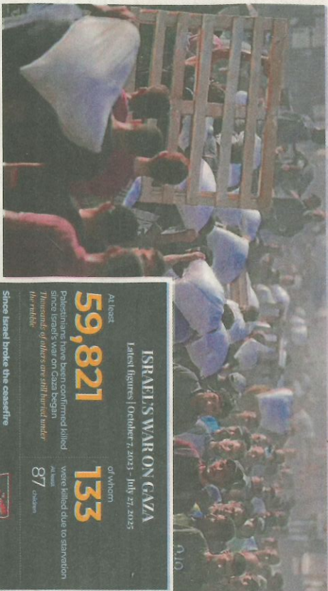
Desperate, deadly times... Palestinians carry sacks of flour unloaded from a humanitarian aid convoy that reached Gaza City from the northern Gaza Strip on 26 July 2025.