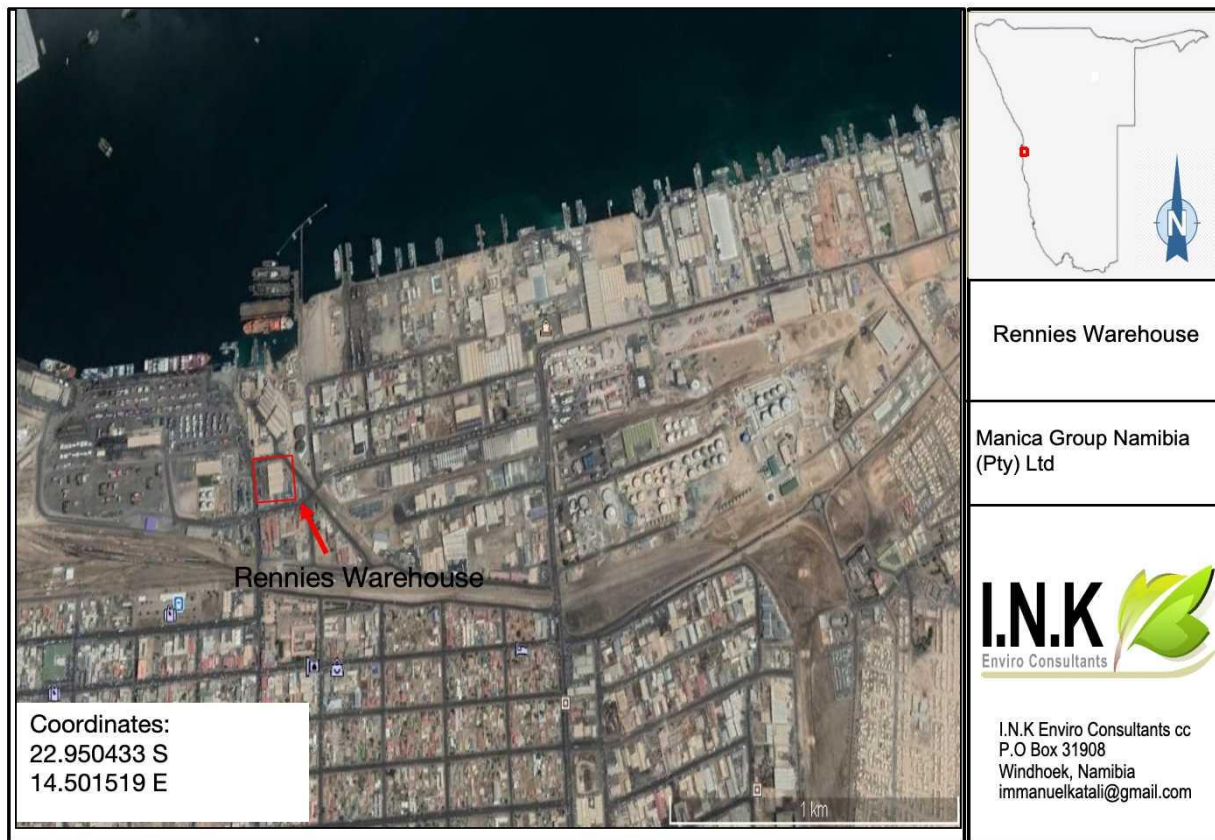
Figure 1: Locality Map