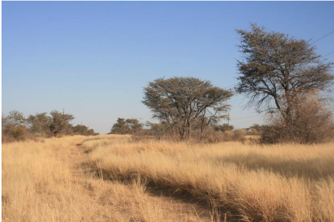
Figure 3. The route is fairly open for most of the way, especially along the NamWater pipeline route.