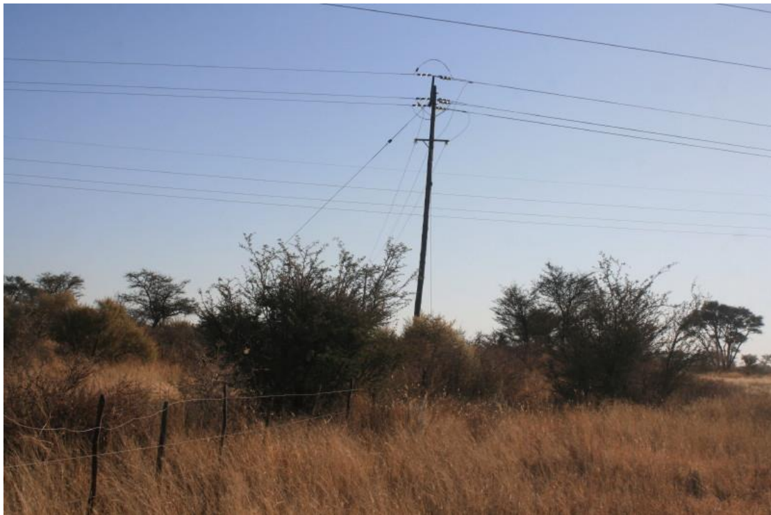
Figure 2. Vachellia erioloba (camel thorn) often forms dense patches under the line and is dominant throughout.

The general Witvlei - Witvlei Farmers line route is typically associated with certain anthropomorphic influences mainly associated with roads and tracks, lifestyle estate developments and farm developments. The impact of line inspections and general maintenance activities would be site specific and have a relatively small environmental “footprint” and is not expected to have a major impact on the environment, (Cunningham, 2022). Figure 2 – 3 show some of the protected plant species found along and in the vicinity of the line servitude.