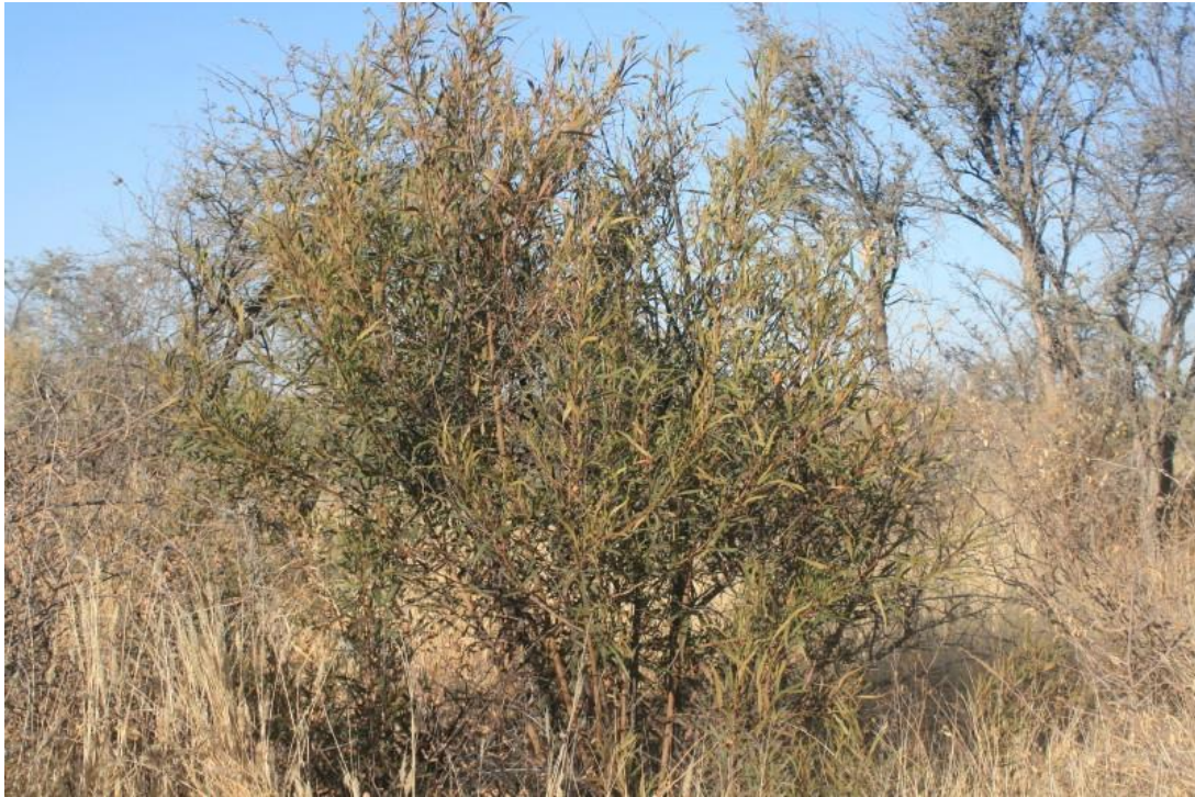
Figure 5. Searsia lancea (karee) trees are uncommon with only a few specimens were observed in shrub form along the line.