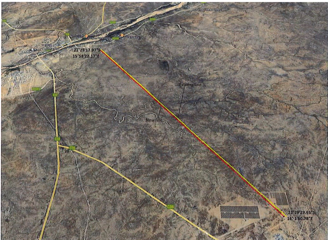
Figure 1: Layout of the Existing (Yellow) & New Powerline (Red)