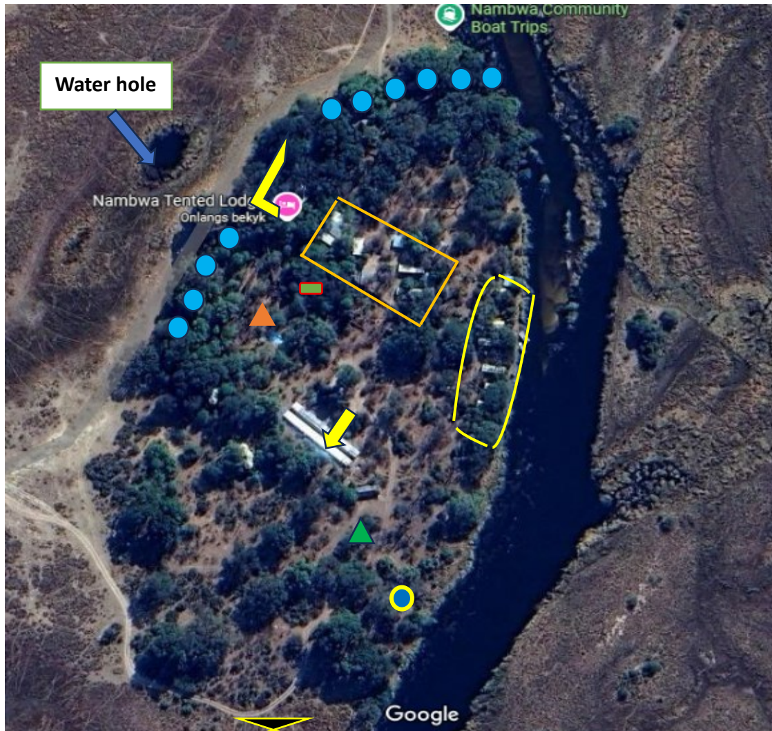
Figure 1: Satellite image (2024), indicating the location of NTL with a detailed layout of current infrastructure. Note: each unit has its own septic tank and soak away system