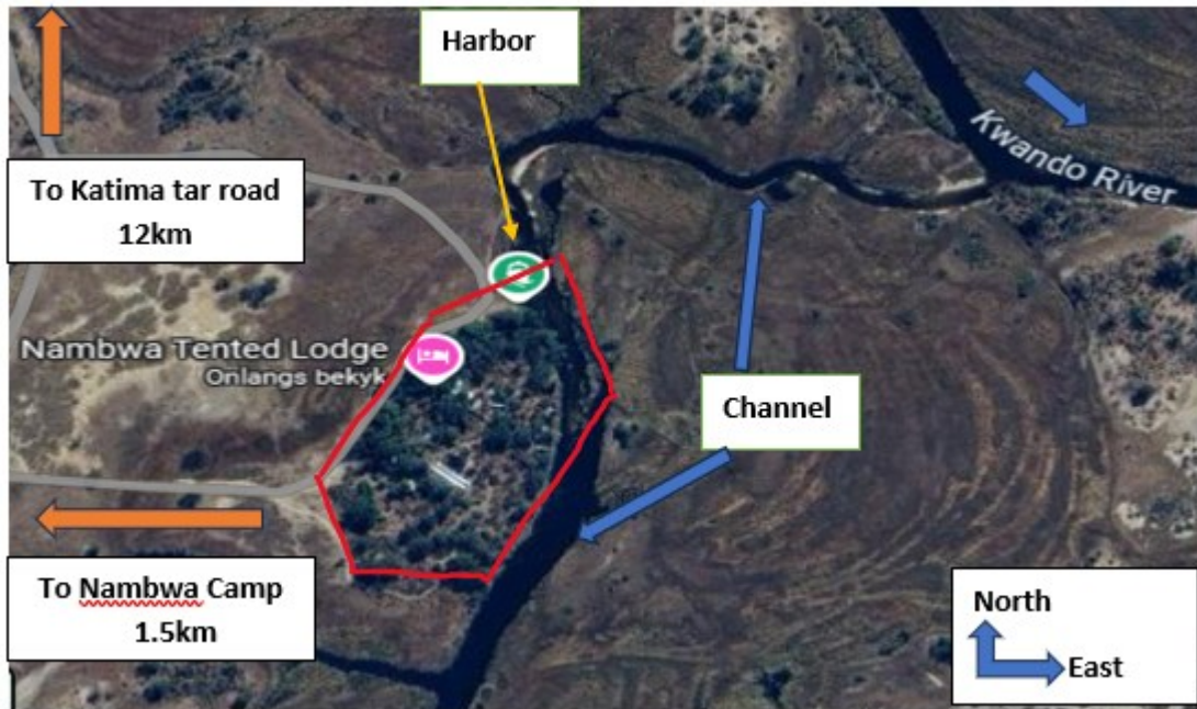
Figure 2: Satellite image indicating the location of Nambwa Tented Lodge (Red Block), on a 5.5ha raised landscape adjacent to a channel west of the Kwando River.

This lodge is situated on one of the numerous channels of the Kwando River as it meanders to the Linyanti River ( Fig. 2 ). The lodge lies on an elevated vegetated “Island” (920m above sea-level) populated with knob-thorn, jackal-berry, mangosteen, combretum, terminalia and sausage trees, and surrounded by grassland, sedges and reeds.