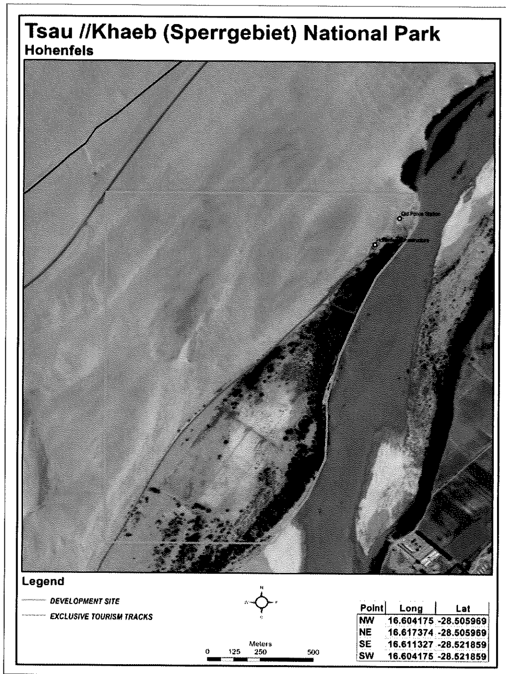
Table 1: Perimeter coordinates of the Concession Area: