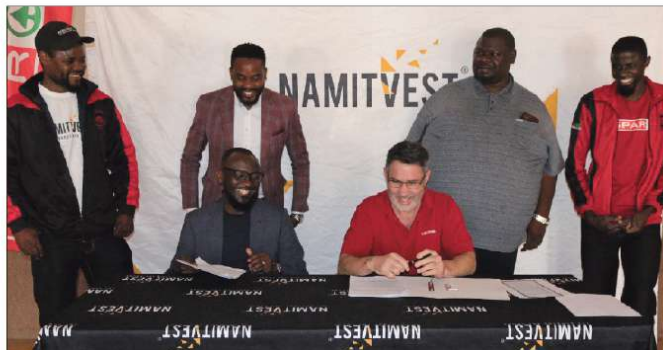
EMPOWER: Representatives of NamitVest, Spar, and the Mine Workers Union of Namibia ink a payroll deduction agreement.

(MUN) members and their dependants to purchase shares through monthly payroll deductions over 60 months. The arrangement removes the need for manual payments such as EFTs or debit orders. A set amount is deducted before salaries are disbursed, ensuring consistent investment contributions. NamitVest has in the