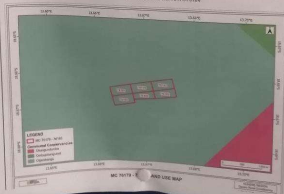
Land use map around MCs No. 76179-76184

Excel Dynamic Solutions Environmental Impact Assessment & Planning