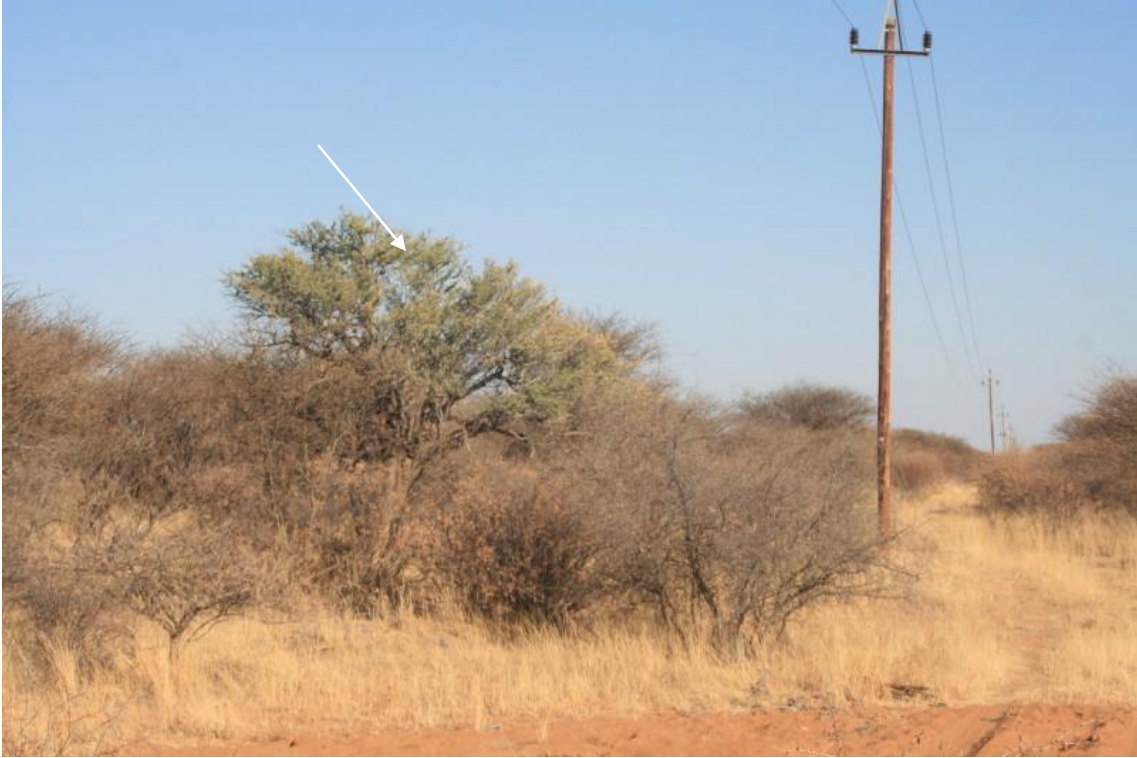
Figure 5. Boscia albitrunca (shepherd's tree) are the most common protected tree species along the route (See arrow).