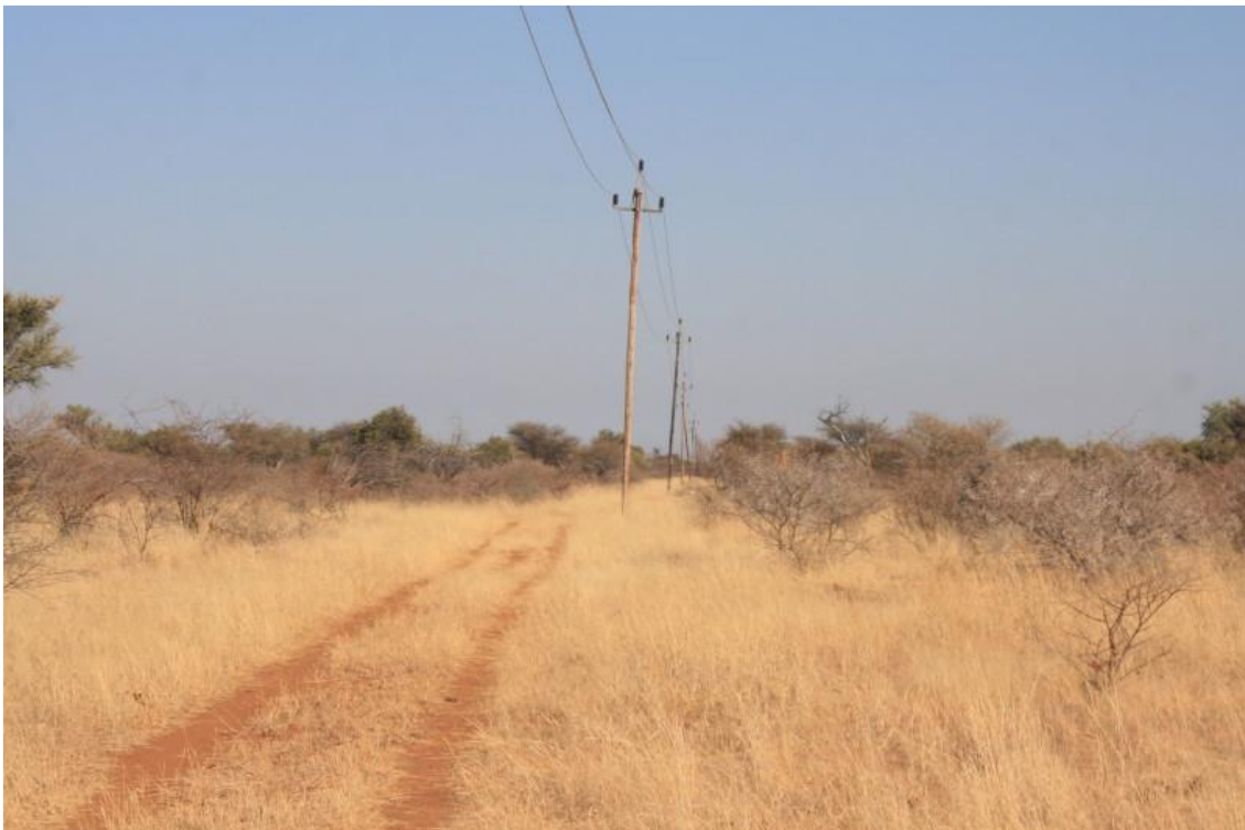
Figure 2. Acacia mellifera (black thorn) is the dominant shrub along this route.

The line passes through 0 “hotspot” areas, making the route viewed as low sensitivity, with no unique habitat. (Cunningham, 2022). Figure 2 – 6 show some of sensitive areas and the protected plant species found along and in the vicinity of the line servitude.