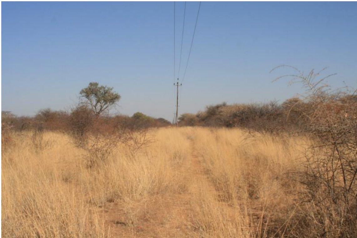
Figure 6. The entire route is viewed as “low” sensitivity – i.e. no unique habitats.