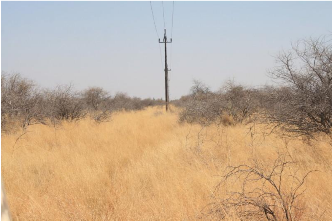
Figure 3. Numerous farmers have poisoned the Vachellia spp. with extensive areas covered by dead trees/shrubs along the route.