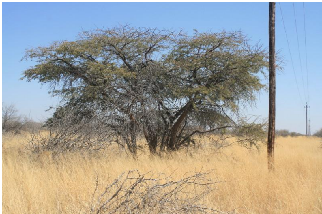
Figure 4. Vachellia erioloba (camel thorn) individuals occur along the line.