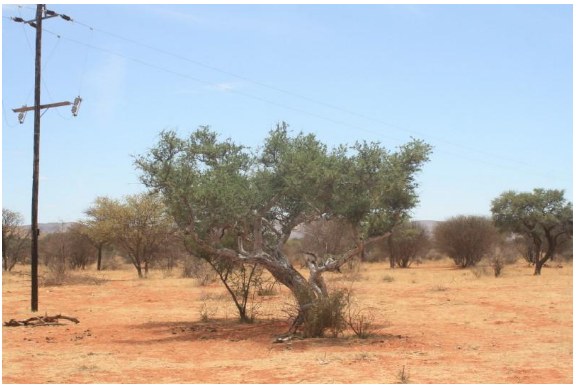
Figure 4. Boscia albitrunca (shepherd's tree) trees are common along this line with this specimen observed in the Isolation Station area.