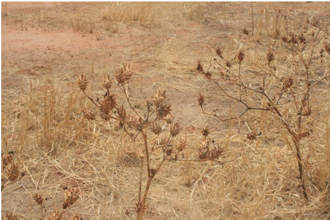
Figure 6. The invasive alien Datura ferox (thorn apple spp.) observed close to water installations and farmsteads.