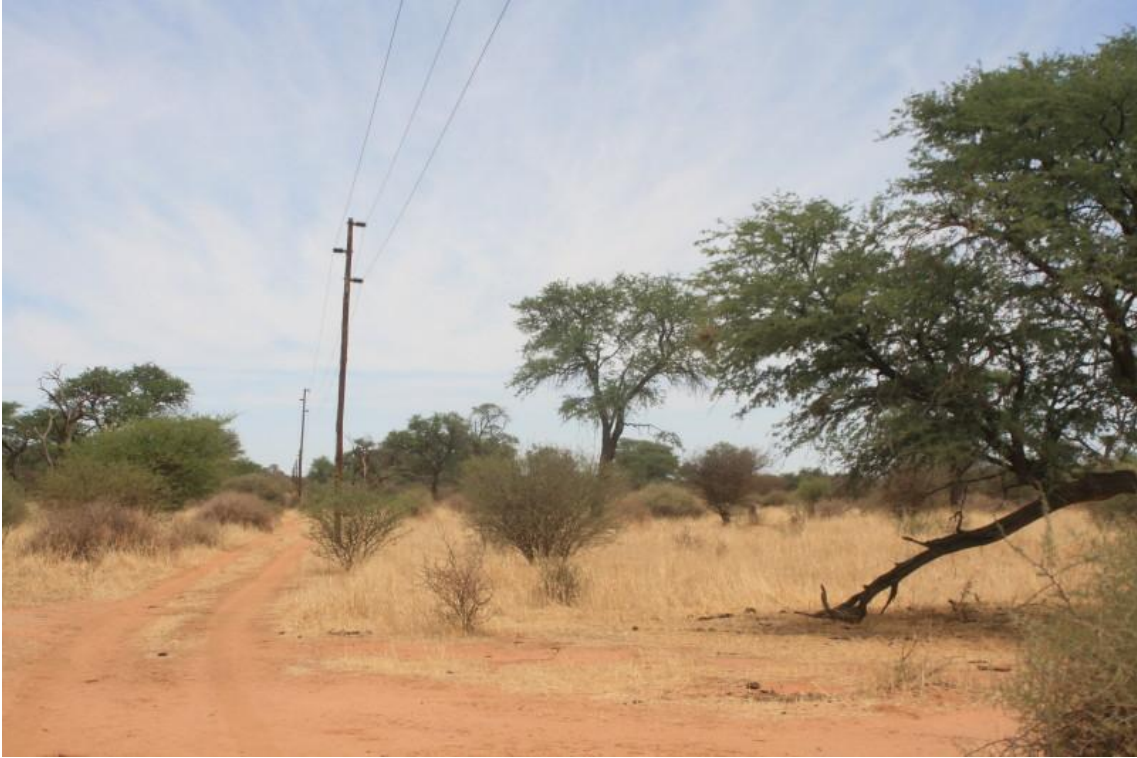
Figure 5. Large Vachellia erioloba (camel thorn) are typical of the Dordabis area.