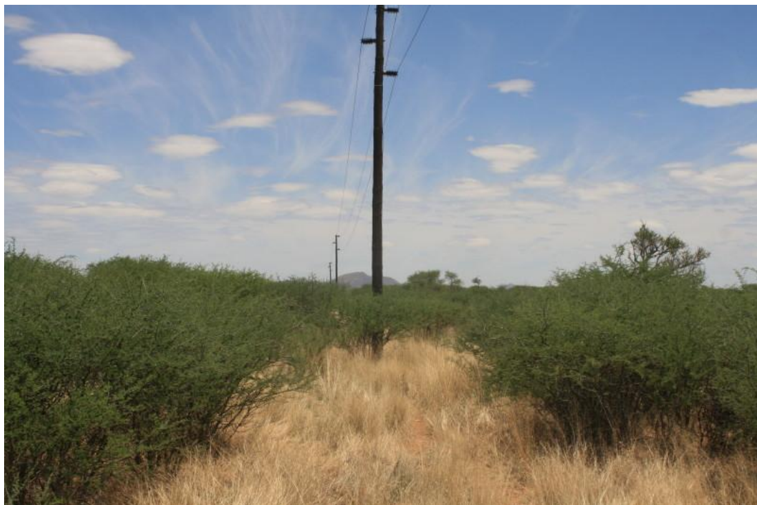
Figure 2. Dense patches of Vachellia mellifera (black thorn) occur in the Seeis Substation area.

The entire Seeis – Dordabis electrical reticulation route passes through three “hotspot” areas of which two are viewed as “high” sensitivity and one viewed as “medium” sensitivity, while the rest of the route is viewed as “low” sensitivity. The important areas along this line include Rocky hill area in the Farm Marula and others stated in the report, (Cunningham, 2022). Figure 2 – 7 show the sensitive areas and some of the protected plant species found along and in the vicinity of the line servitude.