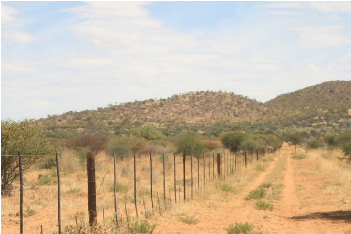
Figure 7. Rocky hill area in the Farm Marula area is viewed as “medium” sensitivity, regarded as high biodiversity areas and thus an important habitat.