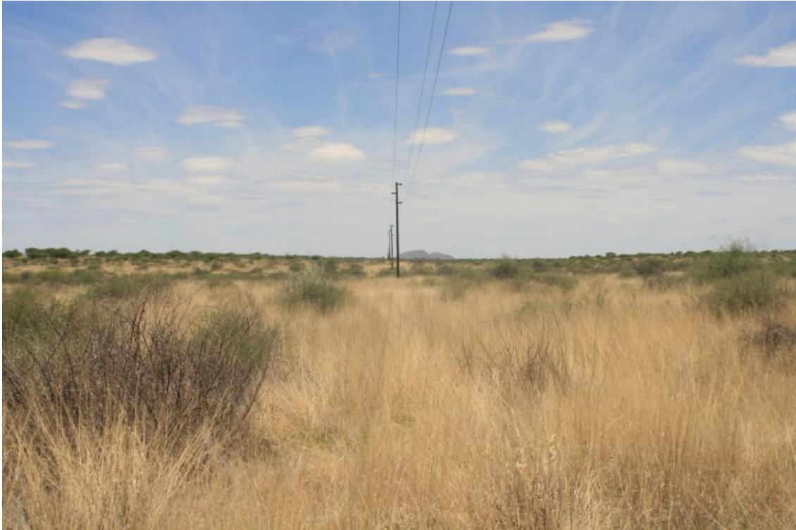
Figure 3. Open grassy area with low shrubs southeast of the Seeis Substation.