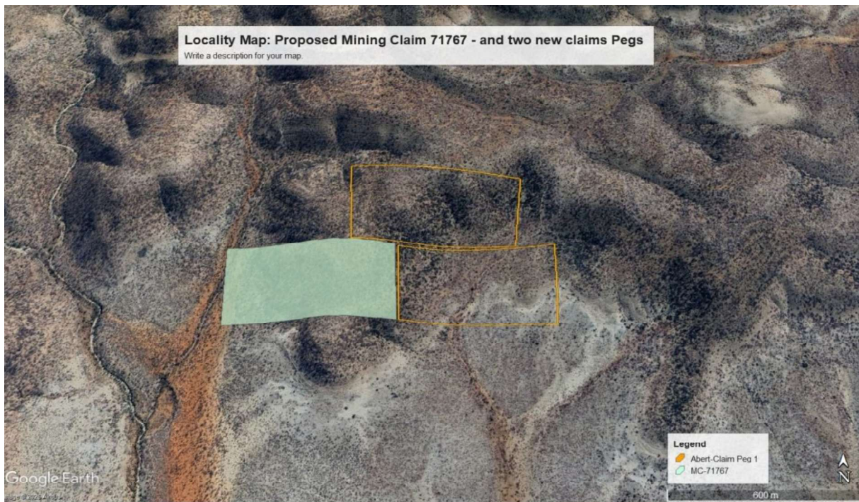
Figure 4: Locality map of the proposed Mining Claim 71767 at Omao, Kunene Region

The location of the proposed license area which constitute Mining Claim (MC 71767) situated in North-western Namibia ( Figure 4 ), North-west of Omao Village in the Opuwo Rural Constituency in the Kunene Region.