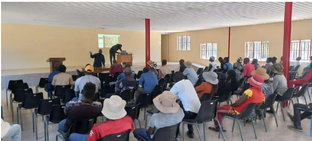
Figure 1. Some photos from the consultation meeting in progress on the 23 rd of May 2025