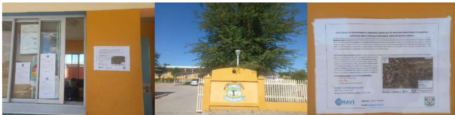
EIA/ESA public notice at the Omuthiya Town Council in Omuthiya