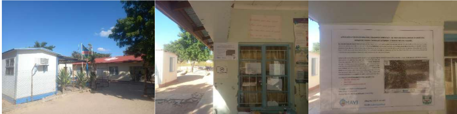
EIA/ESA public notice at the Onyulaye Clinic in Onyulaye