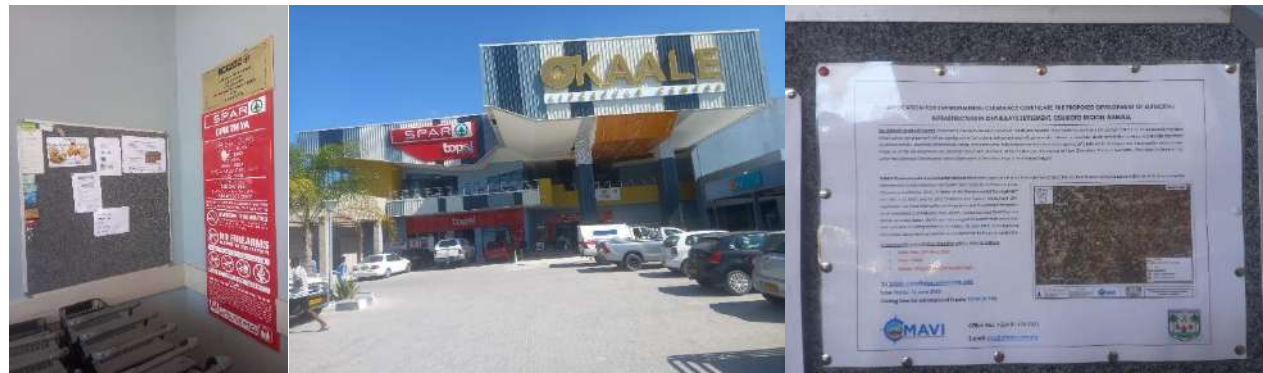
EIA/ESA public notice at the Okaale SPAR in Omuthiya