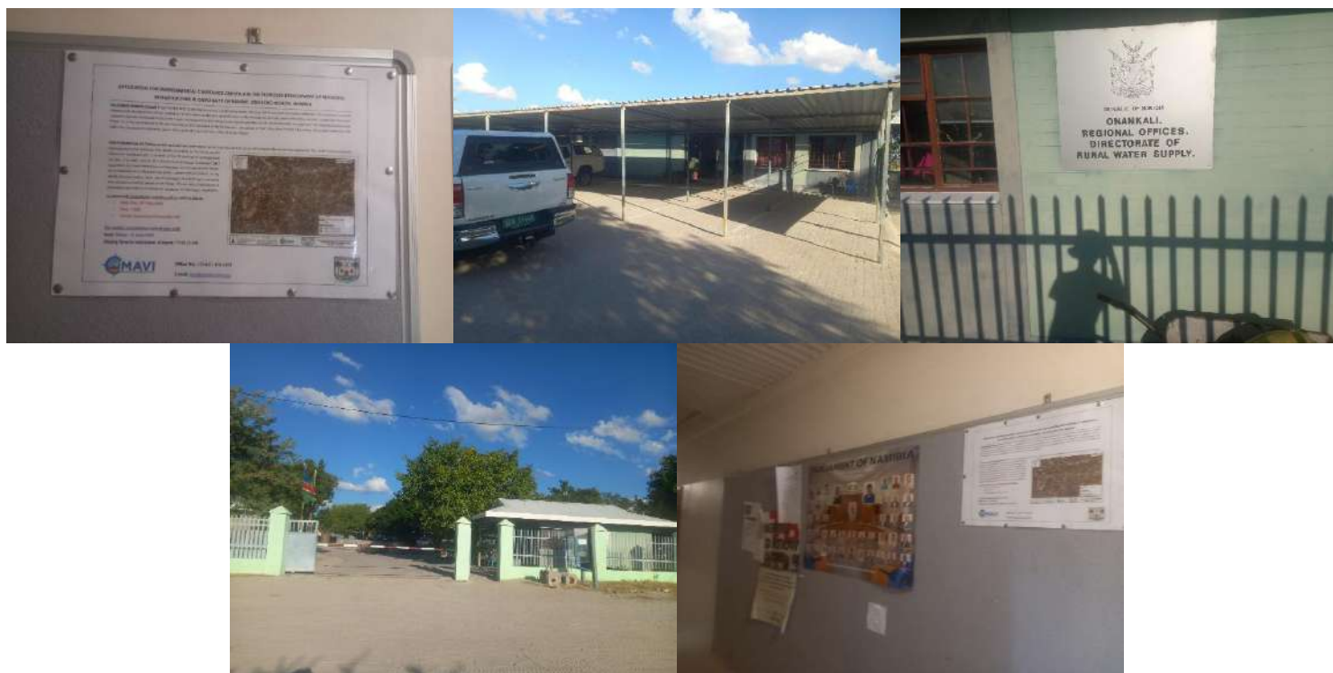
EIA/ESA public notice at the MAFWLR's Onankali Regional Offices: Directorate of Rural Water Supply