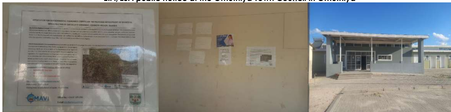
EIA/ESA public notice at the Onankali Clinic