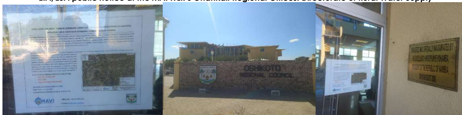
EIA/ESA public notice at the Oshikoto Regional Council Office in Omuthiya