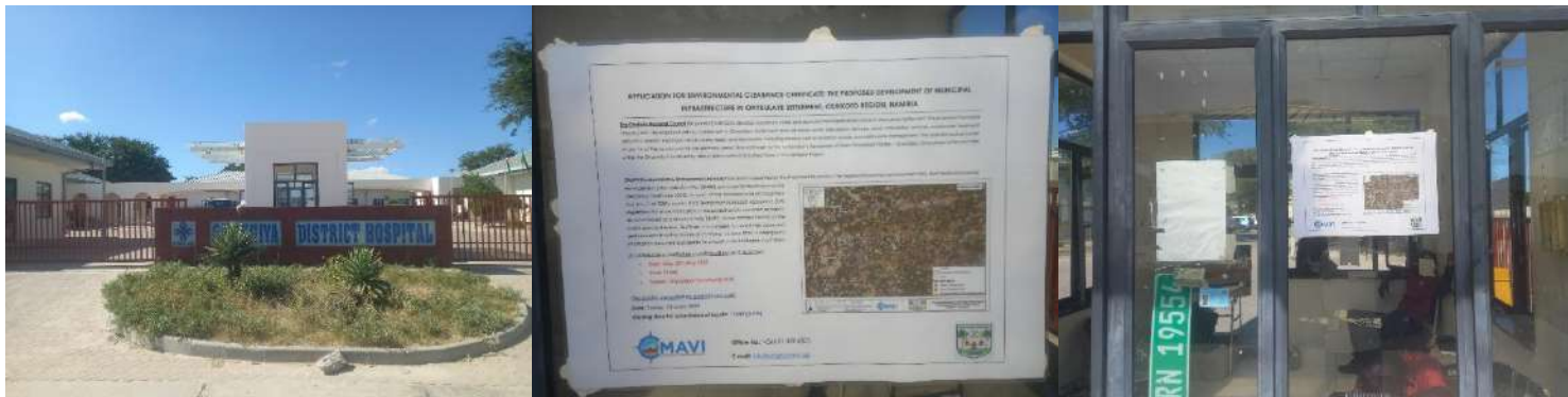
EIA/ESA public notice at the Omuthiya District Hospital in Omuthiya