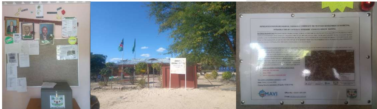
EIA/ESA public notice at the Okankolo Constituency Office in Okankolo