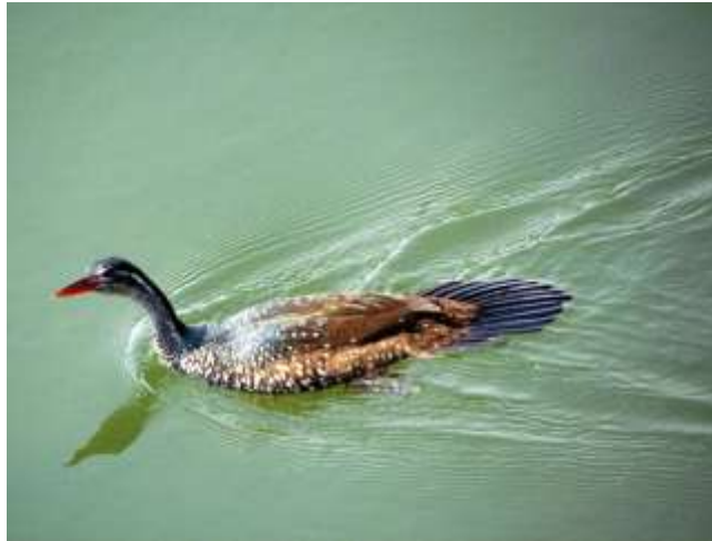
Figure 4: The rare African finfoot spotted from the deck at Caprivi Houseboat Safari (Curt Sagell).

Boat cruises: Sunset, half day, or full day river cruises have lately become popular for day as well as overnight guests. The cruises include trips to Hippo Island and the Sikunga Channel whilst guests enjoy the spectacular Namibian sunset over the Zambezi River. On route hippo and if one is lucky, crocodile and otters can be seen in addition to the numerous bird species along the riverine vegetation. In addition, a unique experience is offered in the form of camper-boats (Fig. 5) which take guests to explore the Zambezi and Chobe Rivers over a 3 to 5 day cruise.