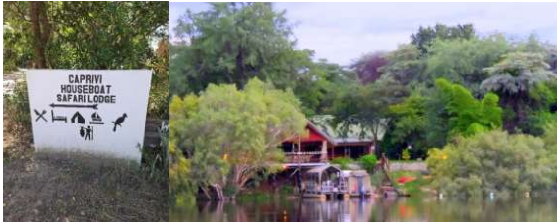
Figure 1: Arrival sign (E Klingelhoef) to Caprivi Houseboat Safaris and a view from the deck onto the Zambezi River

Relevant Documents as per Policy for ECC renewal