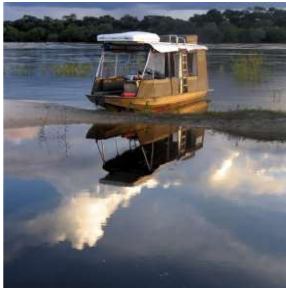
Figure 5: Popular camper boat cruises on the Zambezi and Chobe Rivers.

Boat cruises: Sunset, half day, or full day river cruises have lately become popular for day as well as overnight guests. The cruises include trips to Hippo Island and the Sikunga Channel whilst guests enjoy the spectacular Namibian sunset over the Zambezi River. On route hippo and if one is lucky, crocodile and otters can be seen in addition to the numerous bird species along the riverine vegetation. In addition, a unique experience is offered in the form of camper-boats (Fig. 5) which take guests to explore the Zambezi and Chobe Rivers over a 3 to 5 day cruise.