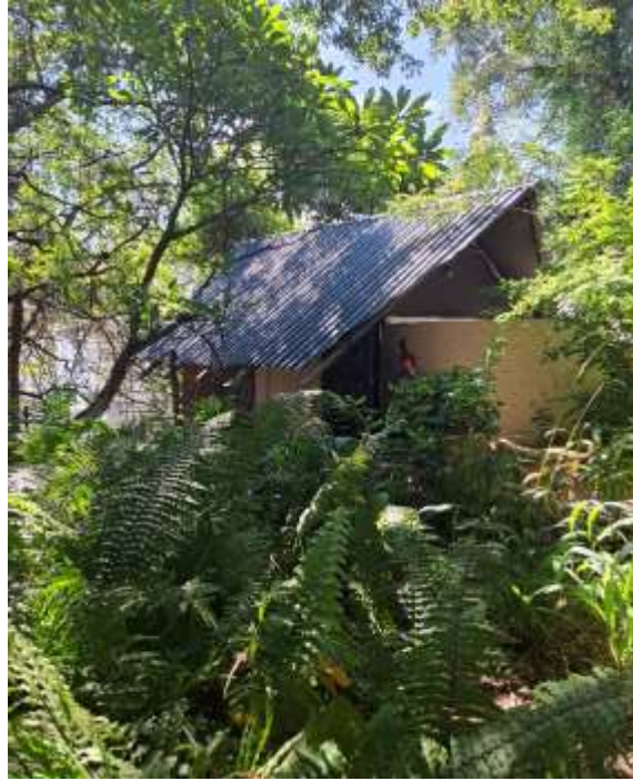
Figure 3: Rustic en-suite chalet with view of the Zambezi River (E Klingelhoefter).