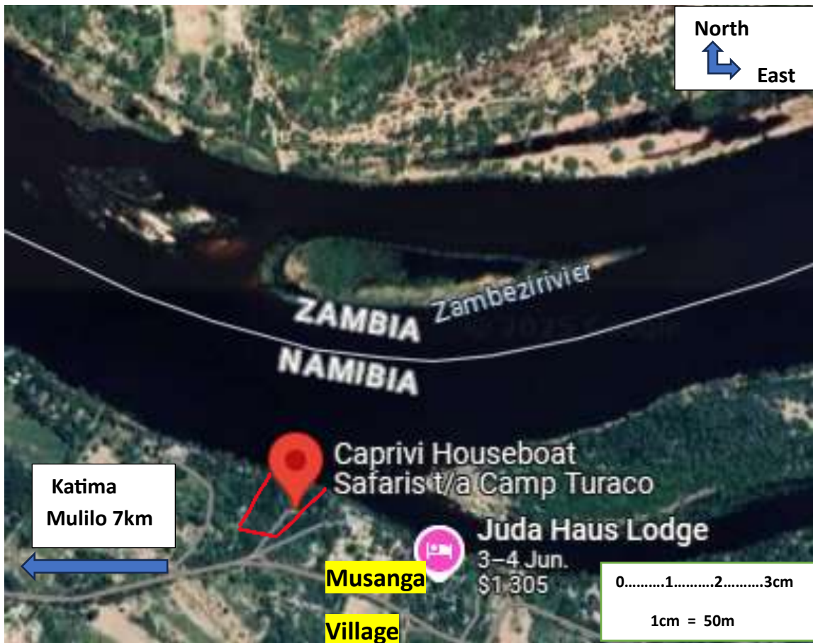
Figure 2: Satellite image indicating the location of Caprivi Houseboat Safari ( Red Block ), a 0.75ha plot on the southern bank of the Zambezi River close to Musanga Village.