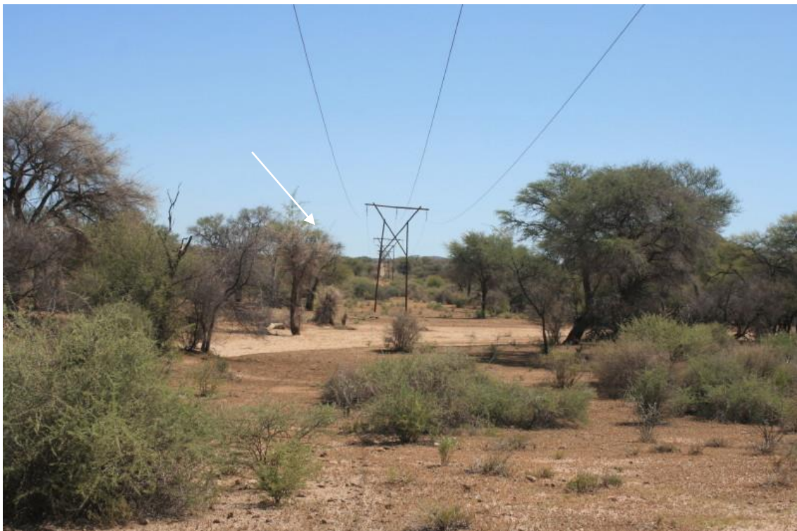
Figure 4. Faidherbia albida (ana tree, protected) seen in larger well vegetated ephemeral drainage lines (See arrow).