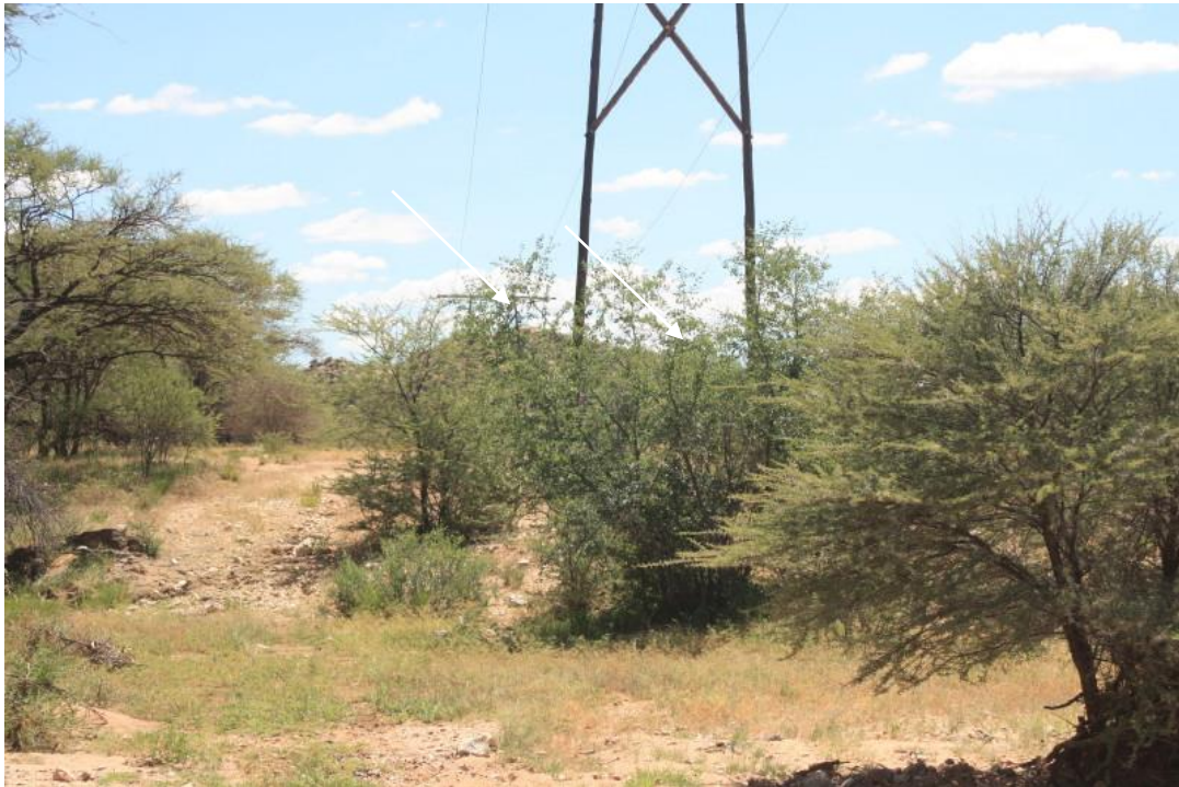
Figure 5. Ziziphus mucronata (buffalo thorn, protected) under the line and associated with large and smaller drainage lines (See arrows).