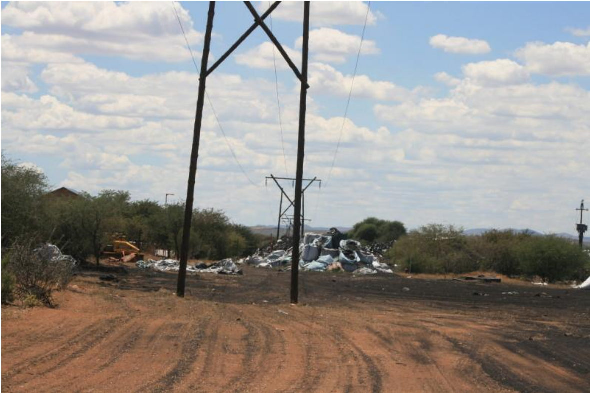
Figure 9. Urban areas (Jumbo Charcoal plant) are viewed as sensitive (“medium”), not for biodiversity reasons, but rather human proximity, gardens, water points.