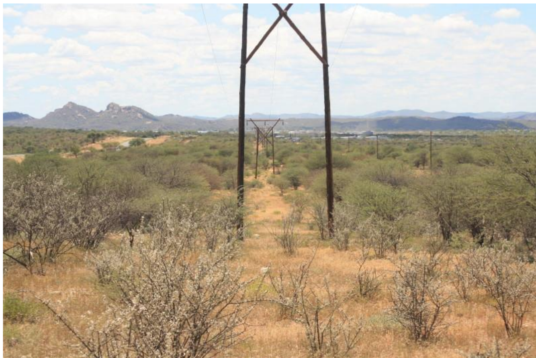
Figure 6. The dominant trees/shrubs along the route were Vachellia reficiens (red thorn) and Catophractes alexandri (trumpet thorn – grey shrubs in foreground).