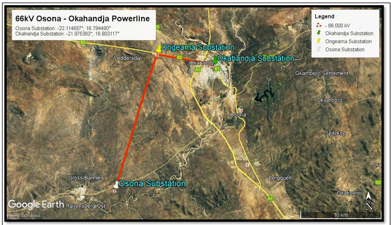
Figure 1: Locality map showing the 66kV Osona - Okahandja transmission line.

The 66kV Osona - Okahandja powerline was constructed in 1978, and it is 24.8 km in length. This powerline runs from the Osona Substation to Okahandja substation in Otjozondjupa Region. This EMP also includes other associated infrastructure which is Ongeama Substation. Okahandja and Ongeama substations cover a footprint of about 1 415 m 2 and 563 m 2 , respectively. The powerline is constructed with Wood (Kamarad) 5 pole structure. Figure 1 shows the locality map for the 66kV Osona - Okahandja transmission line.