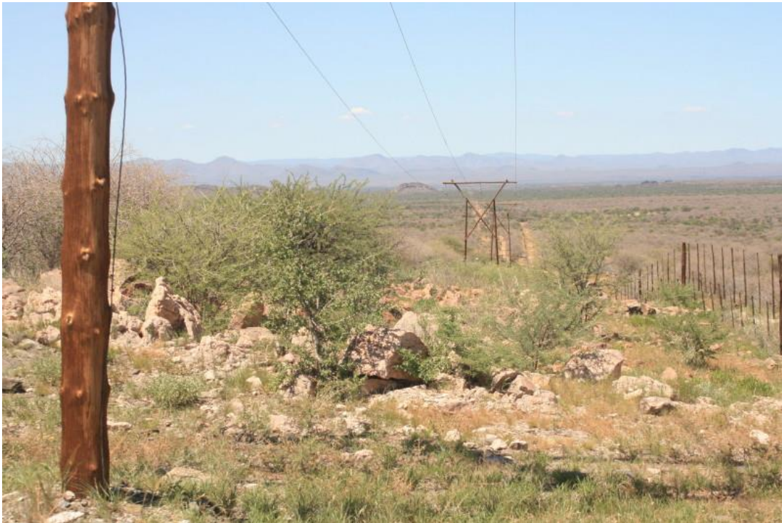
Figure 8. The rocky areas along the route are viewed as a sensitive habitat (“medium”).