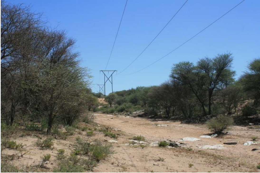
Figure 7. The larger, well vegetated ephemeral drainage lines with large trees are viewed as sensitive habitat (“high”).