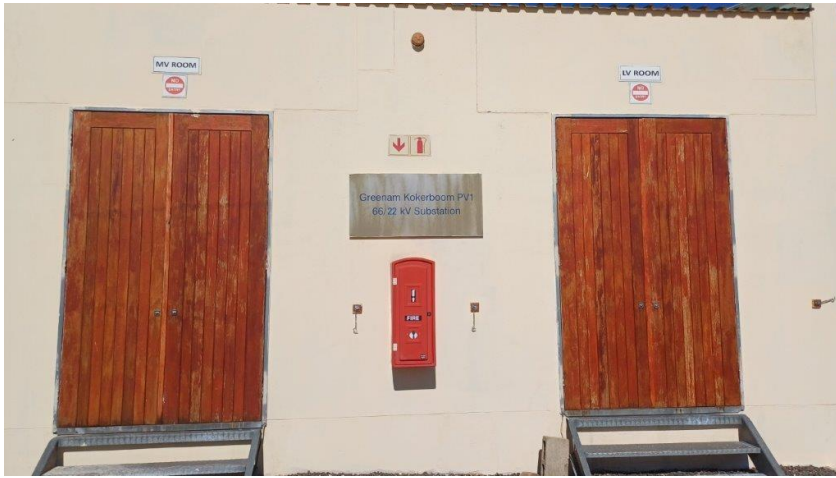
Photo 13 – View of site's substation building with fire extinguisher.