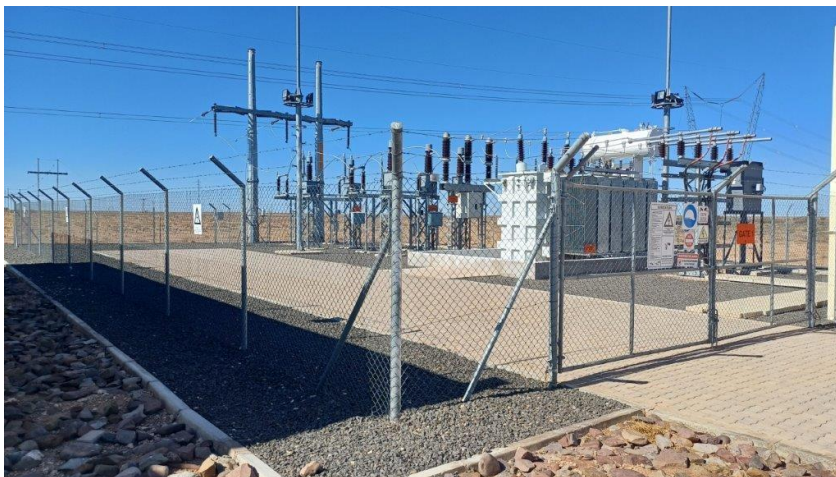
Photo 11 – View of site's substation fenced-in and well maintained.