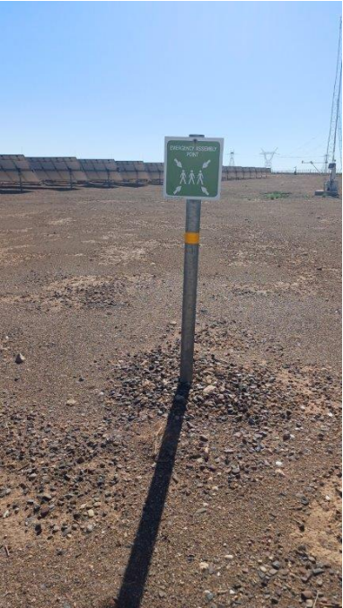
Photo 16 – View of emergency gathering point, close to site office.