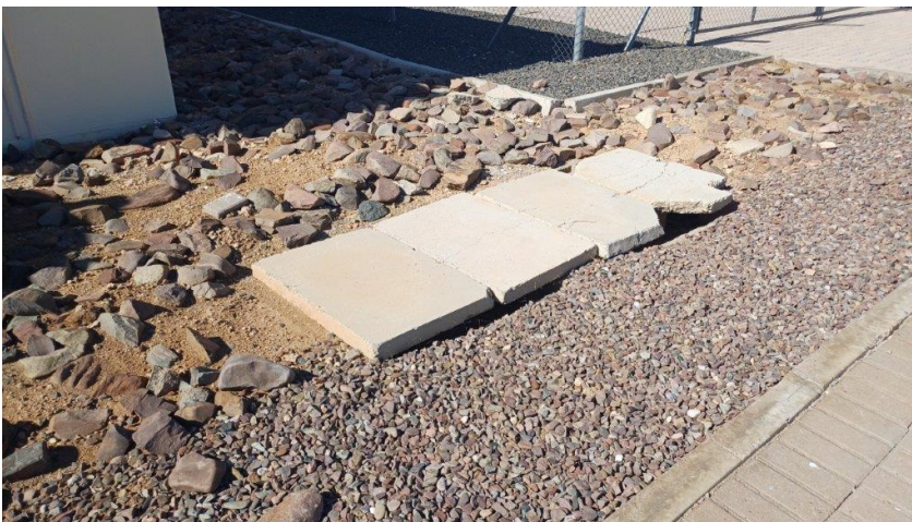
Photo 19 – View of septic tanks, well maintained and good condition. No spillages detected.