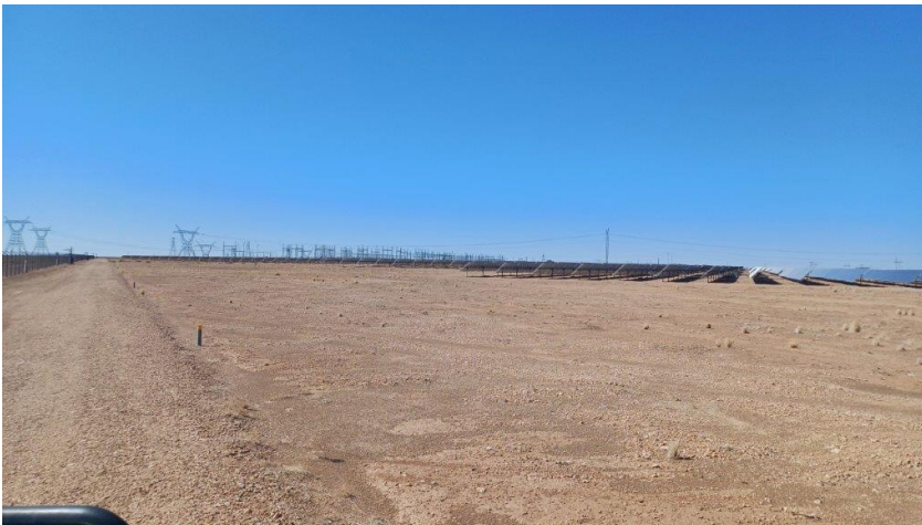
Photo 23 – View of PV panels with very little ground cover vegetation, mainly due to poor rains.