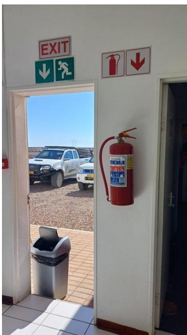
Photo 9 – View of fire extinguisher at site office with emergency exit.