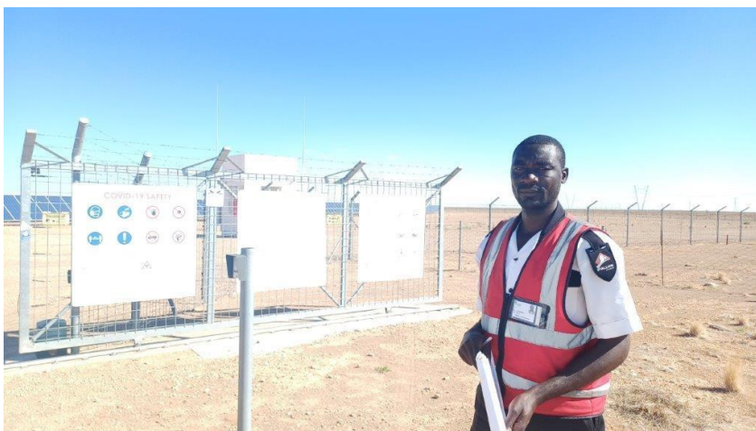
Photo 2 – View of Project site security guard with visitor's register book.