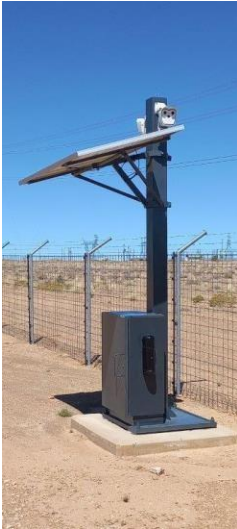
Photo 21 – View of 24/7 security cameras along the Project's boundary fence.