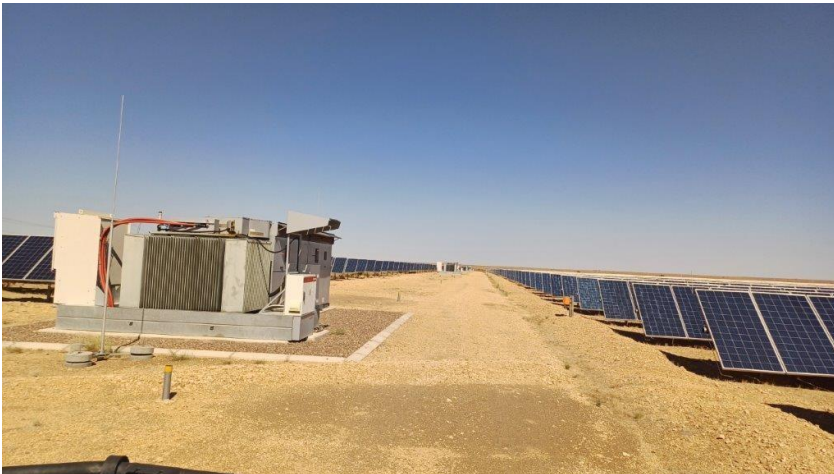
Photo 22 – View of site inverter, well maintained and area surrounding equipment kept clean.