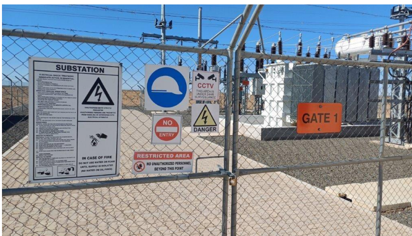
Photo 12 – View of entrance gate to site substation. Access is restricted and warning signs displayed on the fence.