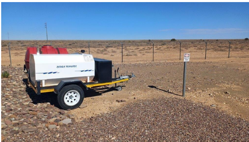
Photo 15 – View of refuel diesel trailer (front) and firefighting trailer (back), both operational and in good working condition.