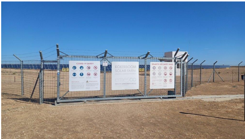
Photo 1 – View of Project site entrance displaying information and warning signs.