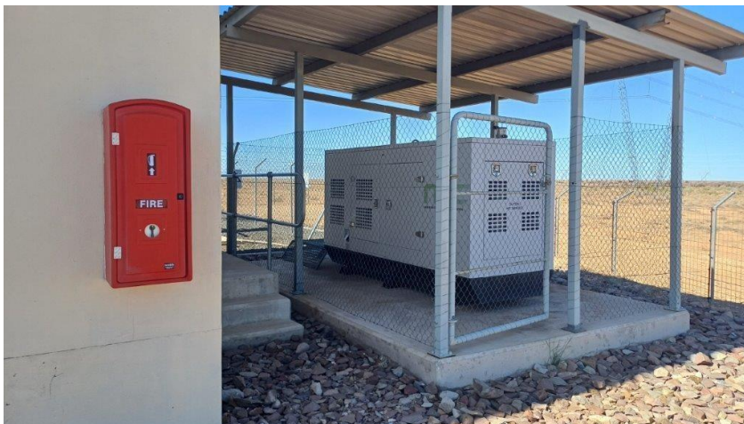
Photo 14 – View of back-up generator to the back of the site office's substation building with fire extinguisher.