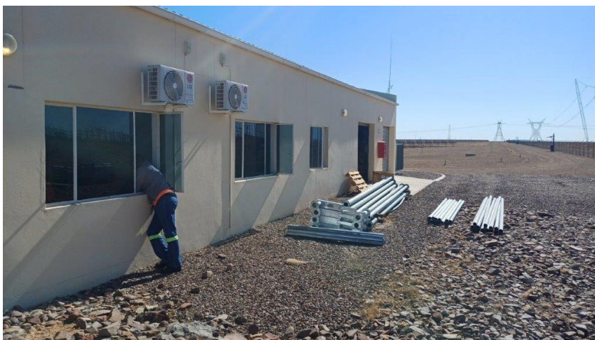
Photo 8 – View of laydown area at site warehouse, kept neat and tidy.