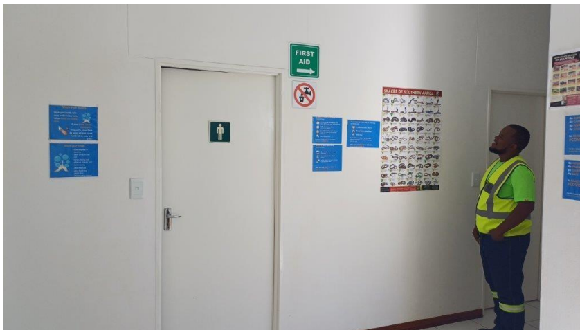
Photo 5 – View of reception area within site office displaying health and safety information and first aid room.