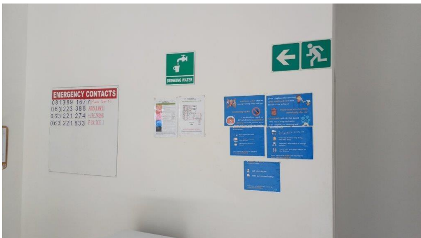
Photo 6 – View of reception area within site office displaying health and safety information and emergency numbers.