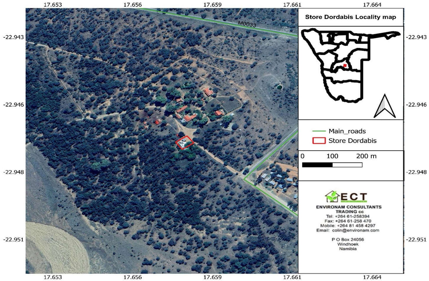
Figure 1: Locality map of Store Dordabis