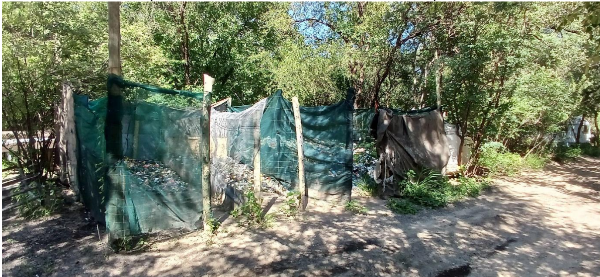
Figure 7. Waste recycling area

Waste is separated in designated waste recycling cages (Figure 7). Food waste is added to the biodigester system, cardboard packing boxes are burnt on site, and recyclable waste is bagged. Glass and other recyclable waste are loaded on empty transport trucks and taken to Maun, Rundu or Johannesburg. A 20 x 20 m temporary holding cage for solid waste is located in the workshop area and is covered on all sides and the top with wire mesh.