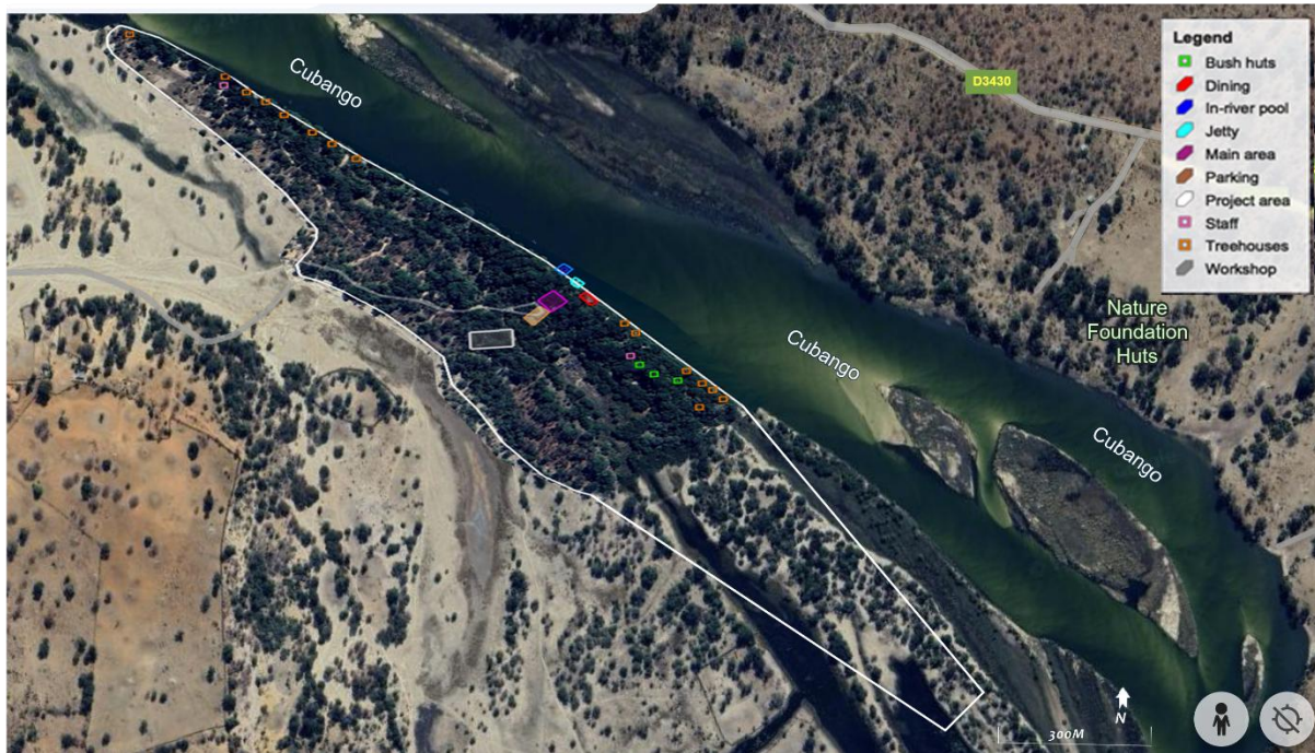
Figure 2. Layout of infrastructure