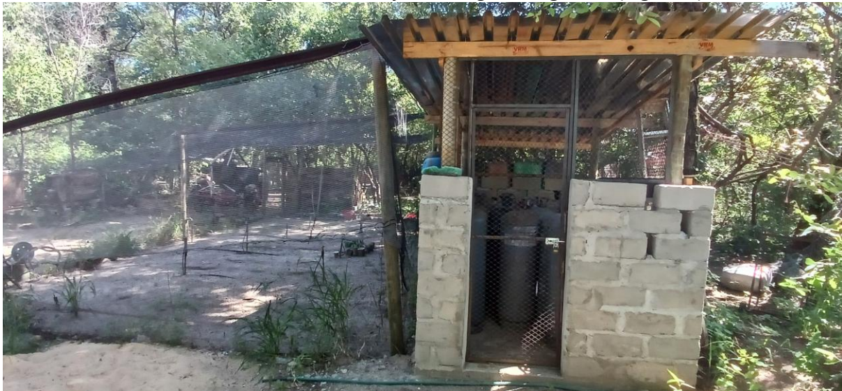
Figure 6. Vegetable garden and gas bottle storage

The laundry is located behind the main area. Laundry is washed by hand in 4 galvanised iron baths. Wastewater is discharged into an adjacent vegetable garden (Figure 6).