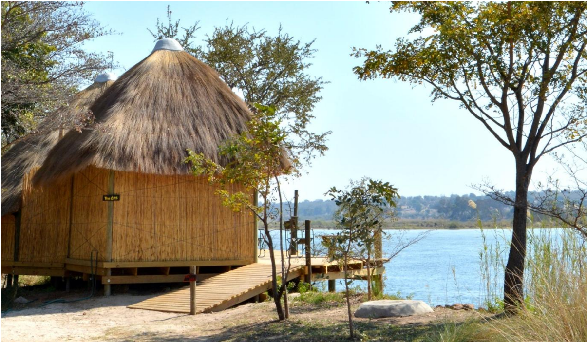
Figure 4. A treehouse on the river