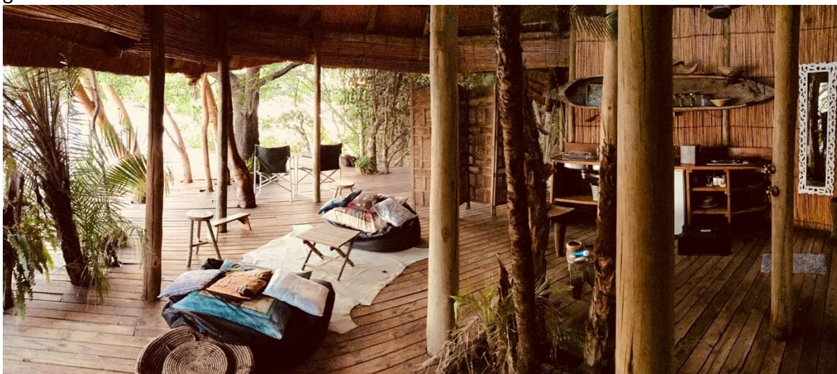
Figure 3. The main area.

The parking area for guests and game drive vehicles is in front of the main area and has a gravel substrate.