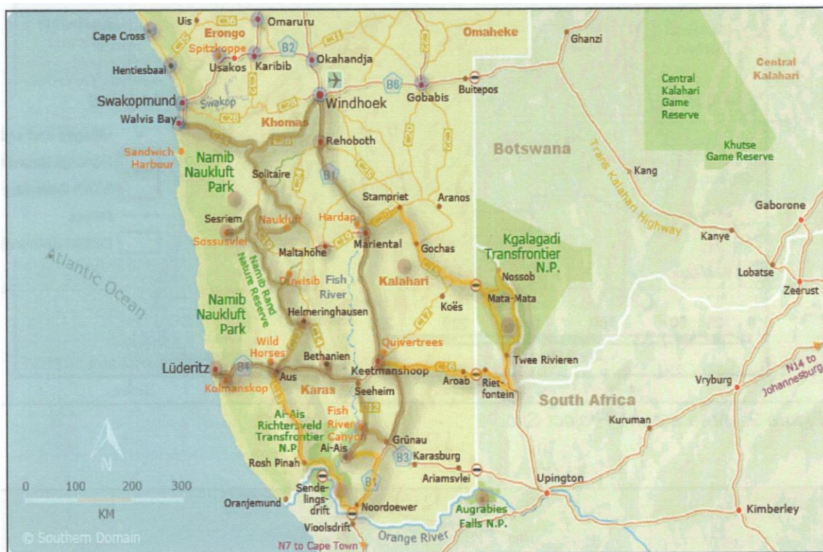
Figure 1: Locality map of Stampriet

The site is located on Farm Stampriet No. 132, adjacently north of the existing Township of Stampriet Village. Farm Stampriet No. 132 is bordered to the south by the Auob River, the Elnatan Private School and Stampriet Village Proper. The farm is bordered to the west by Farm Hoogenhout No. 383 and on the east is found several subdivided portions of the Remainder of Farm Stampriet No. 132. The site is found on the following coordinates: Lat: -24.320496°; Lon: 18.382956°.