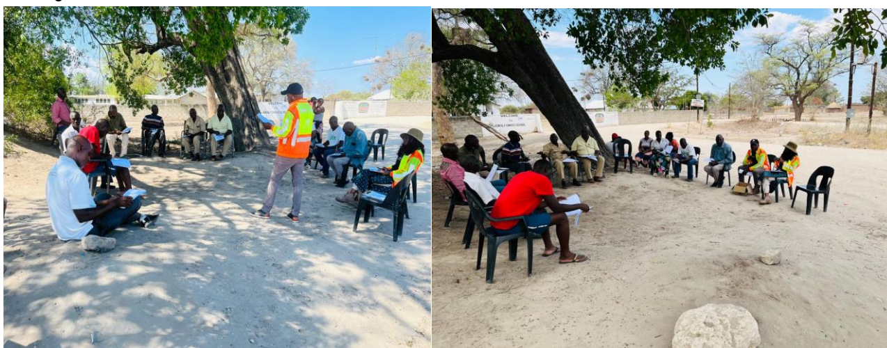
Figure 6: Community engagement meeting conducted at Lisikili Combined School

A public meeting is one of the most important component of public consultation process as it brings the consultant and affected members of the public (particularly from the affected site area) together. The meeting is usually done in an interactive session form so that the community members or members of the public can Public consultation feedback. A public meeting was scheduled on Saturday, 21 December 2024 at Lisikili Combined School, and the meeting was well attended by all stakeholders. Appendix B has a detailed list of the attendance register. The consultant administered questionnaires during the meeting to all members who attended the meeting.