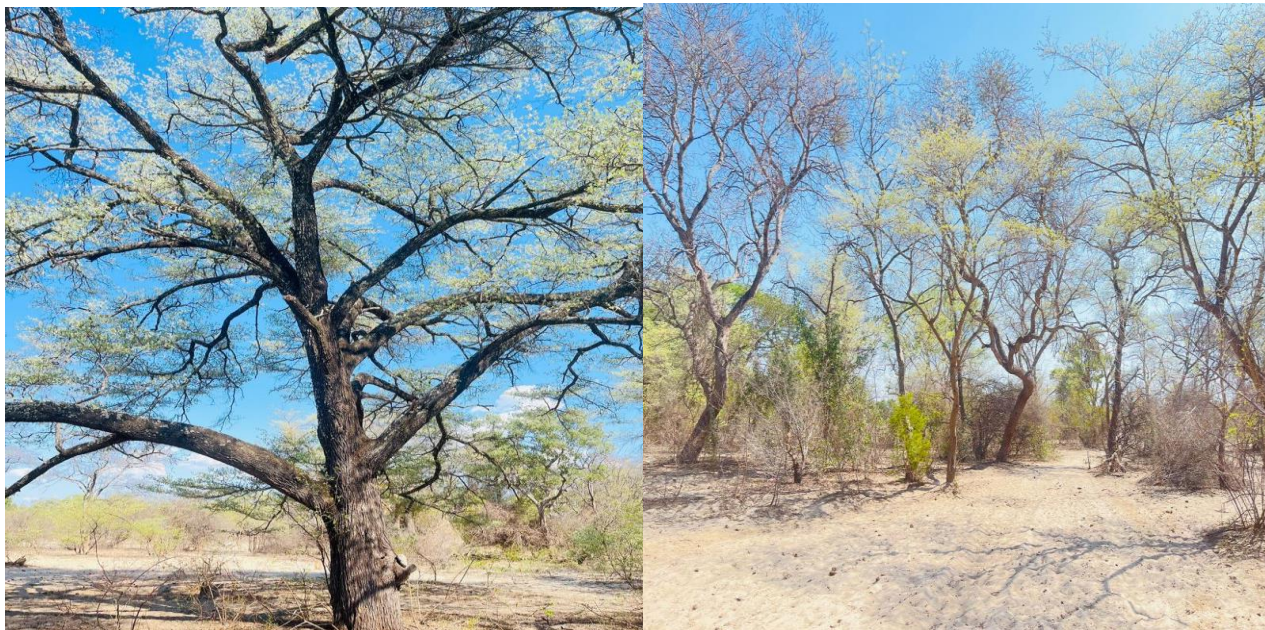
Figure 4: Vegetation found around the proposed project site, Lisikili Village

From the site assessment, the area is mainly dominated by large trees of Terminalia sericea , Burkea Africana , Albizia versicolor , and combretum species. No red data or endangered species were noted/recorded during the site visit. Therefore it was decided that it is not necessary to include an ecological specialist study in the report. But the removal of any vegetation in the surrounding area should still be done in a properly managed, planned and responsible manner to avoid the destruction of unnecessary ground cover or protected species. The rehabilitation of disturbed areas is important and should be done in accordance with the Environmental Management Plan (EMP) hence the project will have minimal impacts on the environment.