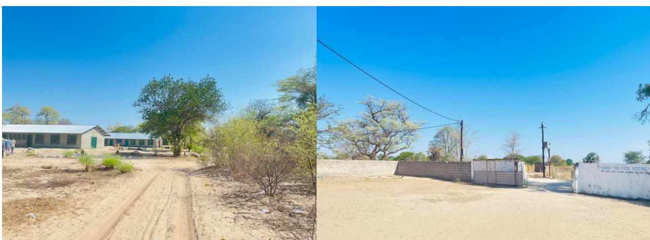
Figure 3: Lisikili Primary School and a transformer sighted next to the school

Service infrastructure: Land in Lisikili is also used for community infrastructure like schools and health posts, though these services are often limited in rural areas. In terms of roads and access routes, there is land allocated for essential infrastructure, including roads, to connect the village with Katima Mulilo and other parts of the region.