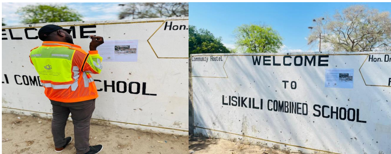
Figure 5: Site Notification, Lisikili Combined School

A site notice (A3) were placed at the local entertainment establishment and the Lisikili Combined School Gate which are close to the site, to inform members of the public of the EIA process and register as I&APs, as well as submit comments. The notices also provided information about the project and related EIA process while providing contact details of the project team.