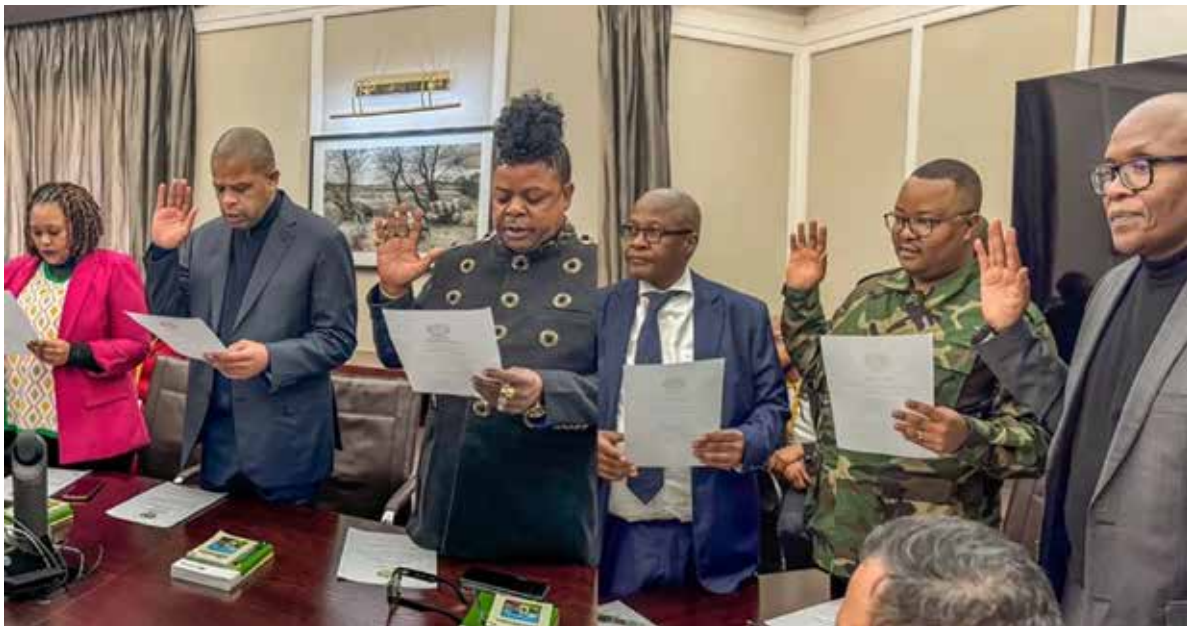
Former Eskom CEO Brian Molefe, and veteran singer Gezani Eric Nkovani, popularly known as Papa Penny were sworn in at the Good Hope Chamber in Cape Town on Wednesday.