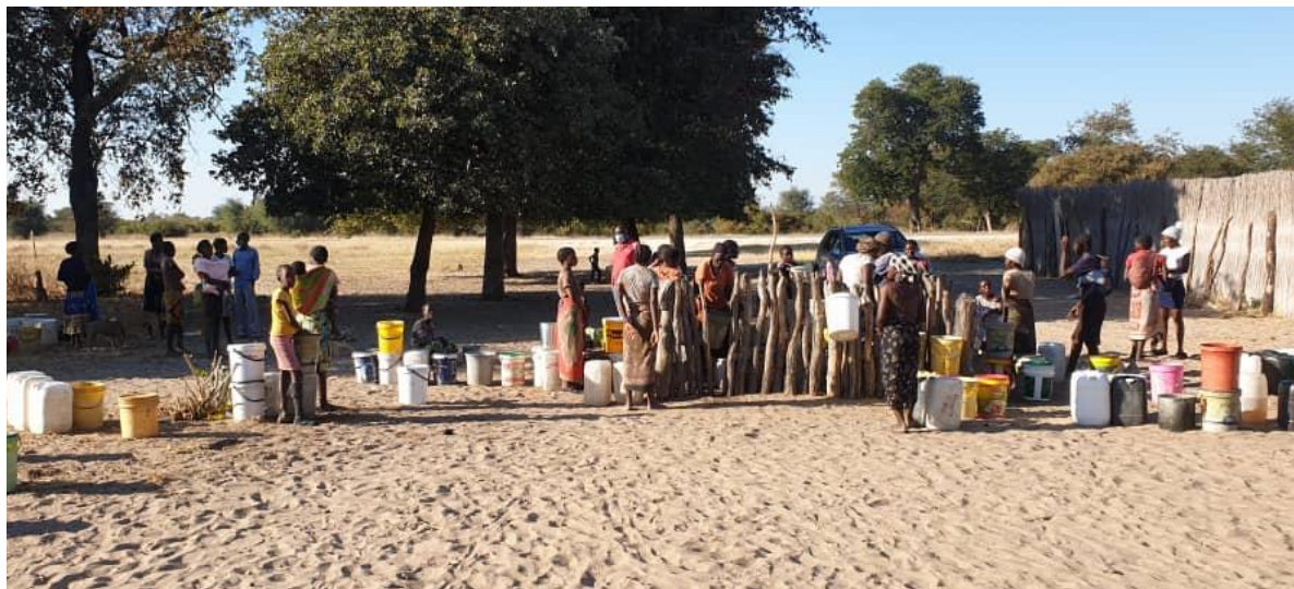
Members of the Sechona community queue for hours to get water at one of the boreholes in the Judea Lyaboloma constituency.