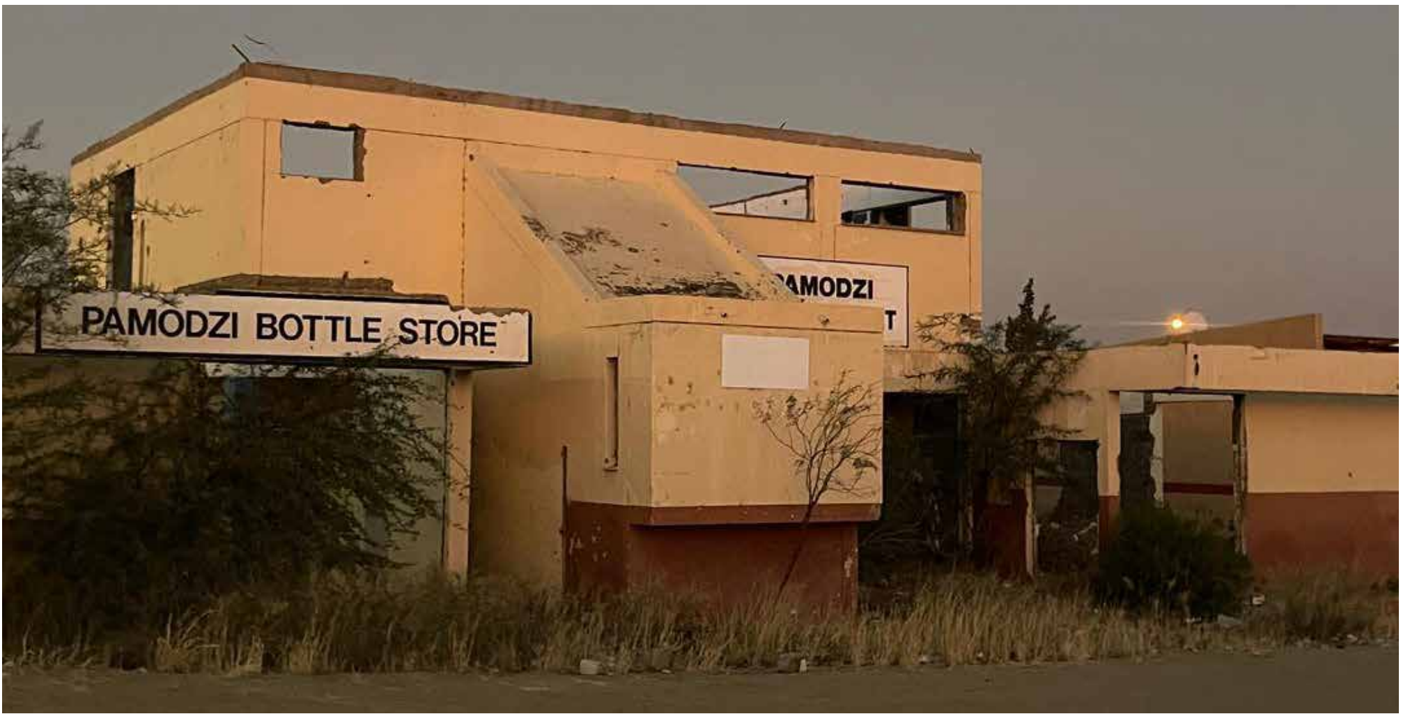
Lack of security has turned Pamodzi into a dangerous place harbouring robbers, causing significant concern among local residents.