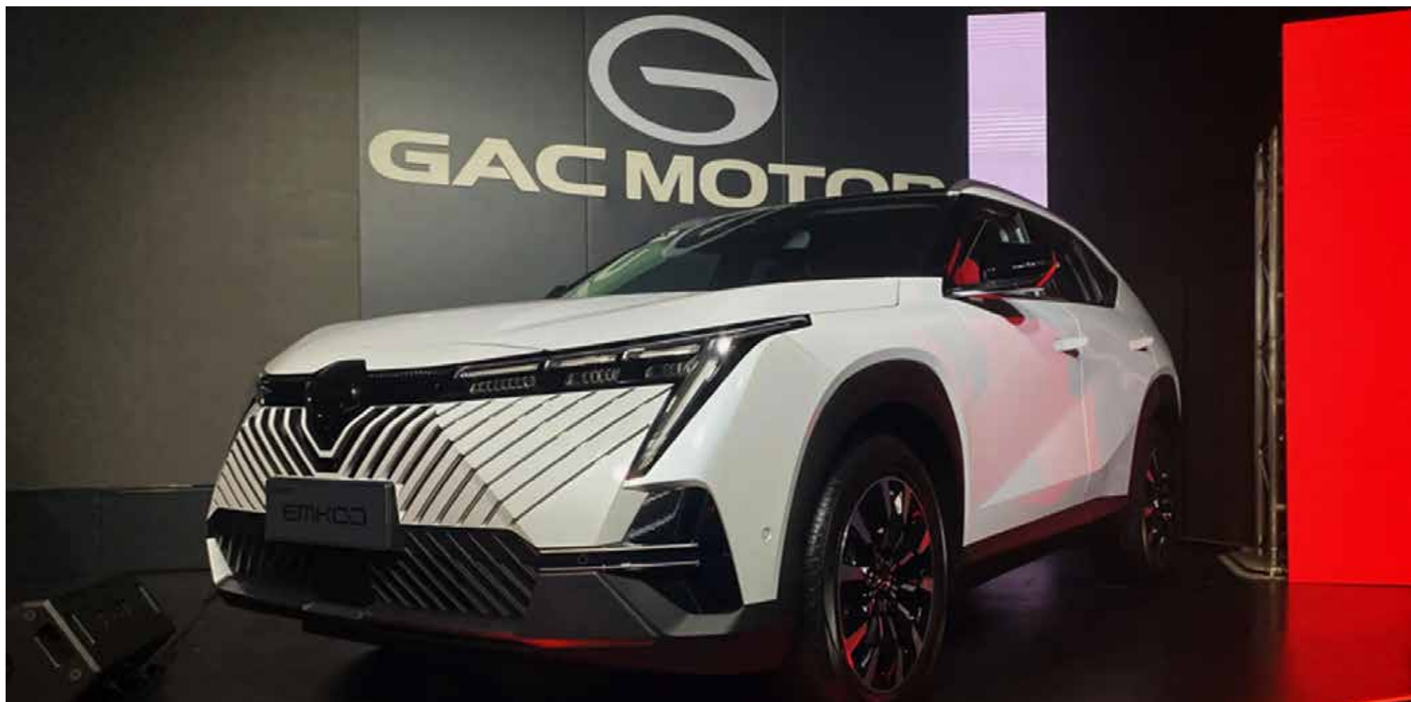
The GAC Emkoo will go on sale in South Africa in September.