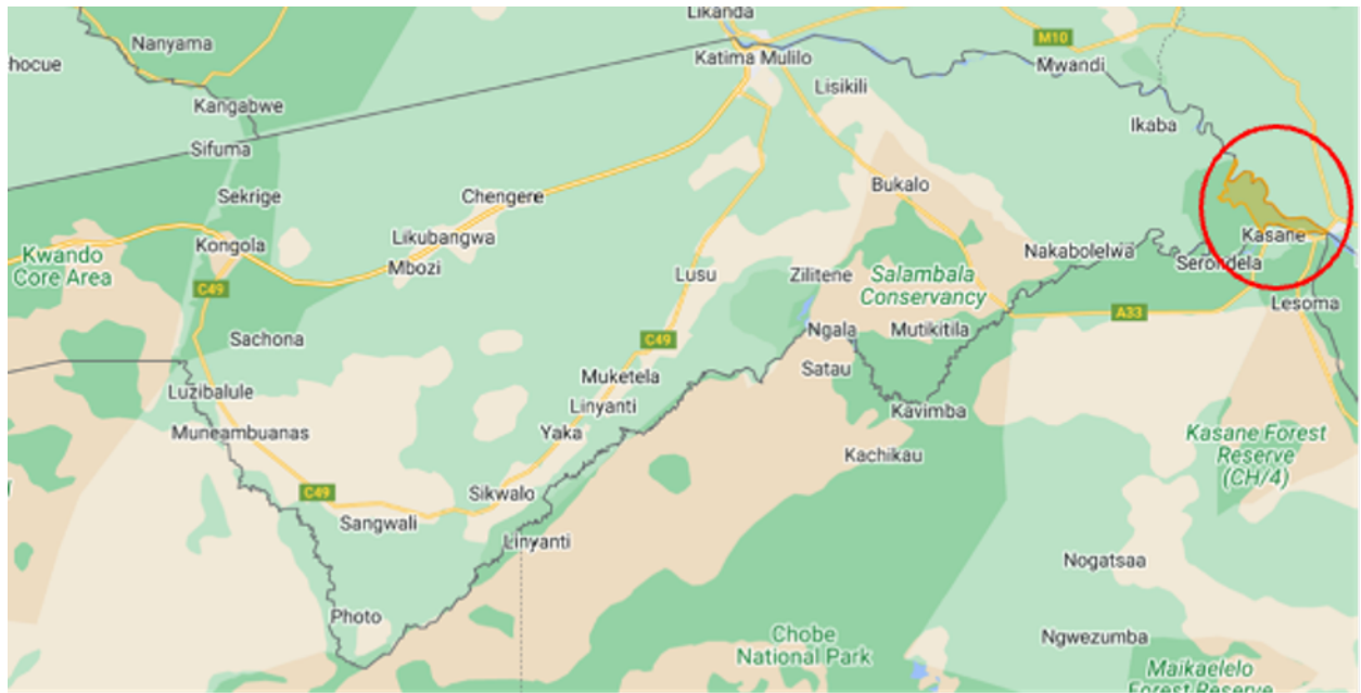
Figure 1. Impalila Island / Conservancy (red circle)

The Impalila Conservancy is located on Impalila Island in Kabbe South Constituency of Zambezi Region (See Figure 2&3 ). The conservancy is situated on the banks of Zambezi and Chobe Rivers at the point where four countries meet - Zambia to the north, Botswana to the south, Zimbabwe to the east and Namibia to the west.