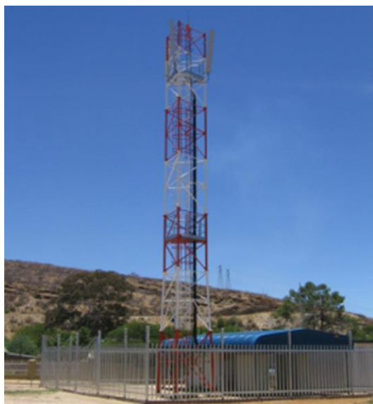
Figure 2: Typical lattice telecommunication tower structure (for visual purposes only)