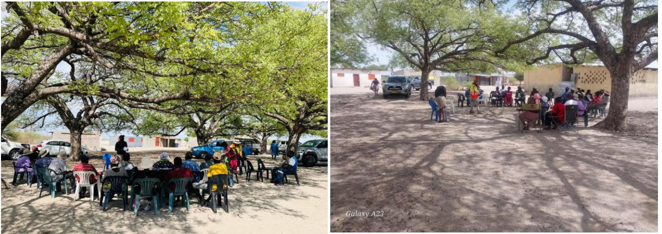
Figure 7: Community engagement meeting conducted in Ontananga

A public meeting is one of the most important component of public consultation process as it brings the consultant and affected members of the public (particularly from the affected site area) together. The meeting is usually done in an interactive session form so that the community members or members of the public can Public consultation feedback. A public meeting was scheduled on Wednesday, 18 December 2024 at Ontananga, and the meeting was well attended by all stakeholders. Appendix B has a detailed list of the attendance register. The consultant administered questionnaires during the meeting to all members who attended the meeting.