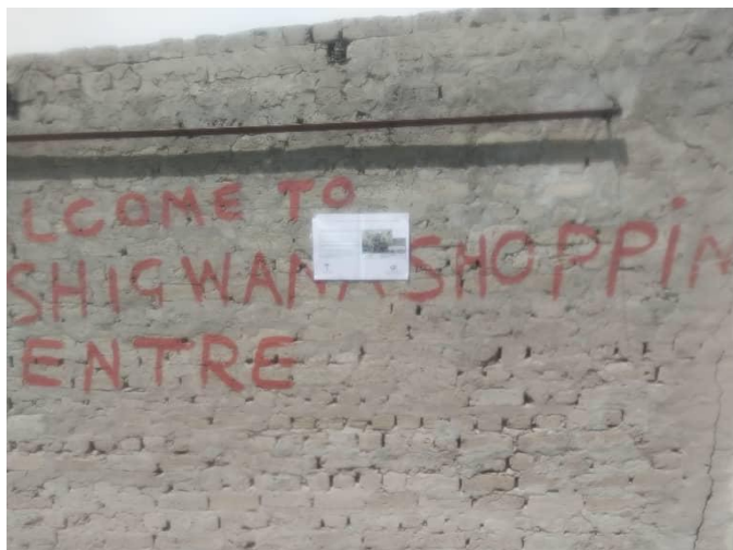
Figure 6: Site Notification – Oshigwana Shopping Centre, Ontananga