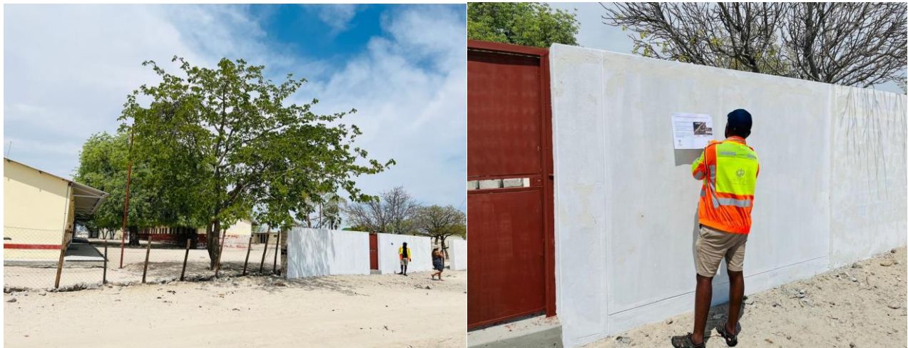
Figure 5 : Site Notification, Ontananga Primary School

A site notice (A3) were placed at the local entertainment establishment and the Ontananga Primary School Gate which are close to the site, to inform members of the public of the EIA process and register as IAPs, as well as submit comments. The notices also provided information about the project and related EIA process while providing contact details of the project team.