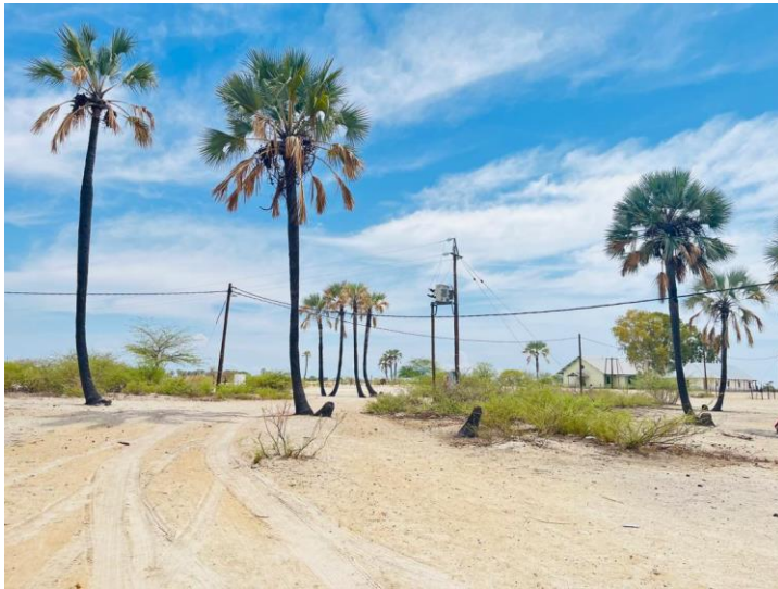
Figure 3: Powerlines and power supply sighted in the vicinity of the proposed site