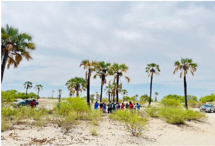
Figure 4: Vegetation around the proposed sight, Ontananga village