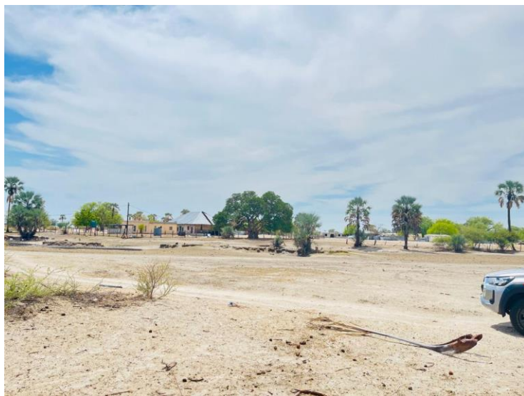
Figure 3. Nearest homesteads from the proposed site about 100m away

Surrounding land uses: The site proposed for the telecommunication tower is located on the South eastern side of the Ontananga School, on an open area closer to old local toilet structures. The site is located about 200m away from the closest residential area, 100m away from a church and about 300m away from the local clinic