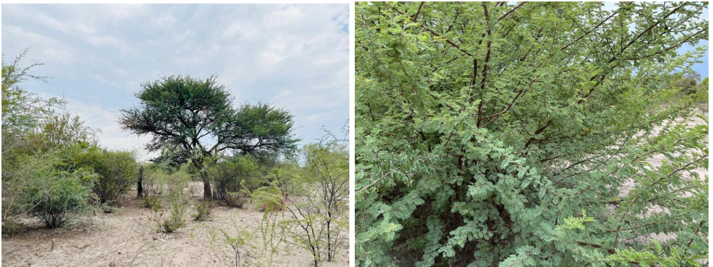
Figure 2: Common vegetation found around the proposed site (Acacia spp.)

The project site is dominated by thorny acacia bush species. The removal of any vegetation surrounding the site area should therefore be done in a properly managed, planned and responsible manner to avoid the destruction of unnecessary ground cover. The rehabilitation of disturbed areas is important and should be done following the Environmental Management Plan (EMP). Noting the project site and its size, minimal impact on the available flora and environment will be done.