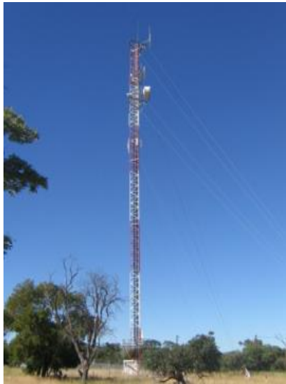
Figure 2: Typical Guyed lattice telecommunication tower structure (for visual purposes only) with guyed anchors for stability.