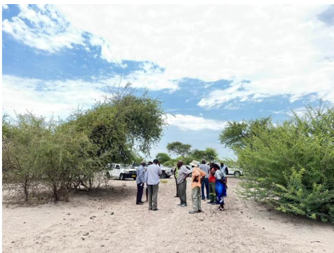
Figure 4: Sandy soil as observed on the project site, Linyanti Village

The geology of Linyanti Village is characterized by its position within the broader Zambezi Basin. The area lies on Quaternary Alluvial Deposits, formed by sedimentary processes from the Linyanti and Zambezi Rivers. These deposits include layers of sand, silt, clay, and organic material brought in by river systems. The potential soil impact in the study area is that the soils in the area are susceptible to wind erosion therefore the disturbance of the soil surface in the vicinity of the project must be minimized to prevent wind erosion. The footprint of the construction area must be kept as small as possible and existing access roads are to be utilized at all times to avoid off-road tracks. The project footprint area should not be cleared entirely and the site should be rehabilitated after the construction phase.