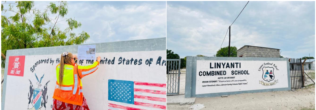
Figure 5: Site Notification, Linyanti Combined School

A site notice (A3) were placed at the local entertainment establishment and the Linyanti Combined School Gate which are close to the site, to inform members of the public of the EIA process and register as I&APs, as well as submit comments. The notices also provided information about the project and related EIA process while providing contact details of the project team.