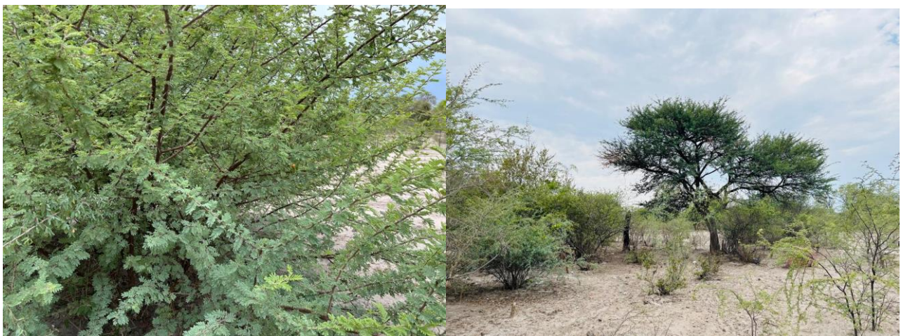
Figure 3: Common vegetation found around the proposed site ( Acacia spp.)

While these species may be common in the rest of Linyanti area, the project site is dominated by thorny acacia bush species . The removal of any vegetation surrounding the site area should therefore be done in a properly managed, planned and responsible manner to avoid the destruction of unnecessary ground cover. The rehabilitation of disturbed areas is important and should be done following the Environmental Management Plan (EMP). Noting the project site and its size, minimal impact on the available flora and environment will be done.