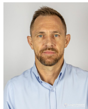
Knight Piésold Consulting (Pty) Ltd., Namibia