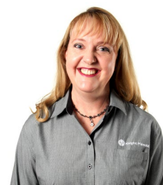
Knight Piésold (Pty) Ltd. South Africa